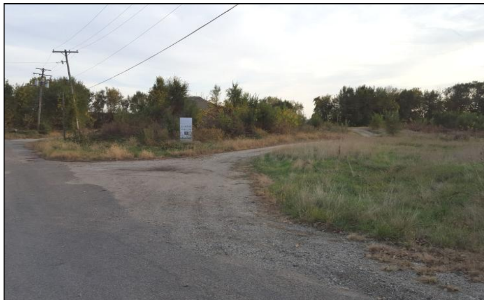
This is part of the riverfront land the city of Peoria plans as a replacement for the current Riverfront Park, which will be sold for privately developed apartments.

The overriding issues remain. Selling public park land for private, for-profit development is unacceptable. The HOI Board revisited this issue at their October ExCom and remains opposed to this development. Please let your Peoria City Council Representative know your continued concerns about this project. If you live outside of Peoria, send a note to the Peoria Mayor's office or a letter to the Peoria Journal Star and help keep opposition to this project visible.