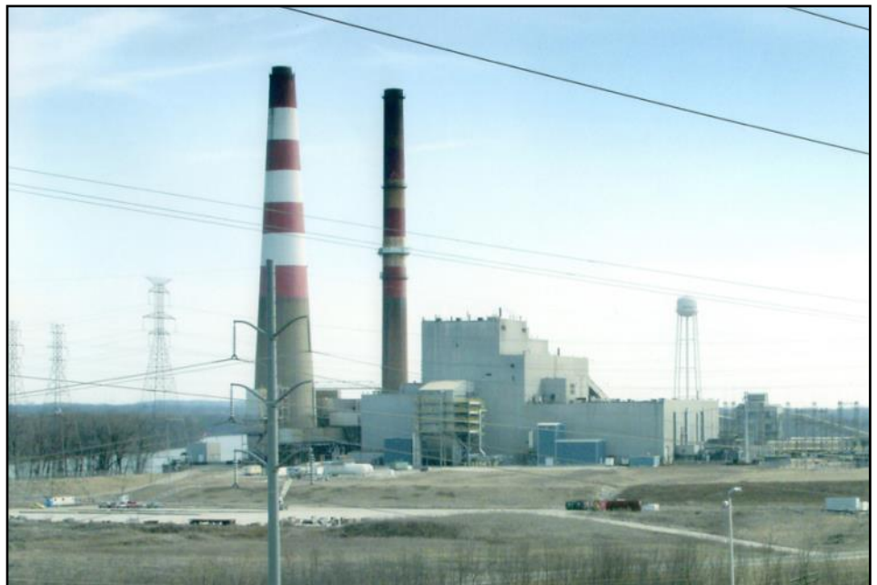
The E.D. Edwards coal-fired power plant near Bartonville