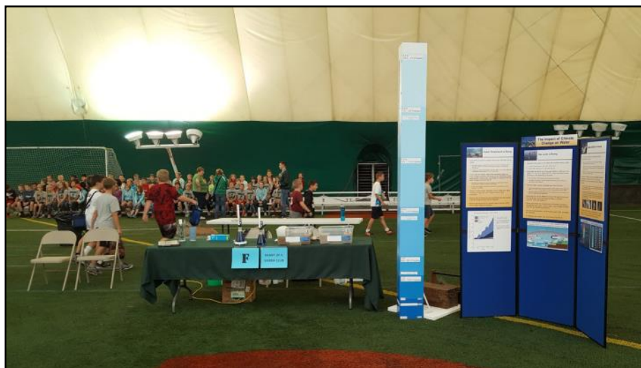
Above: HOI Sierra Group's presentation on "The Impact of Climate Change on the Oceans."