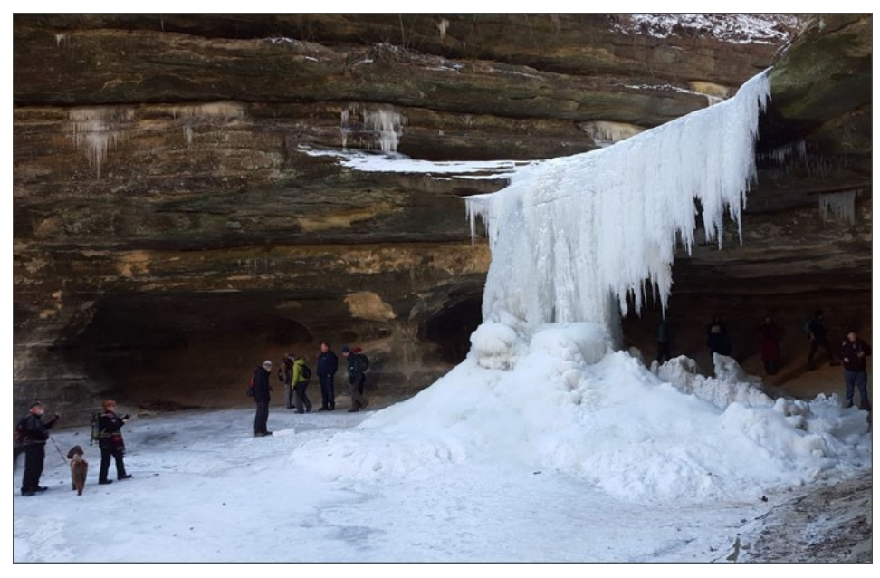
HOI Group Starved Rock winter outing at LaSalle Canyon, 2016

must be taken to control the number of cars and visitors so the safety of the public and the park itself can be protected.