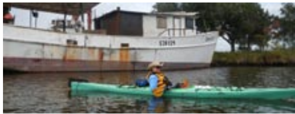
The long and short of it

Well, all right, even if there were a couple of muddy banks to contend with, the paddling on Double Bayou was still great. And there was a lot of diversity, including a large flock of vultures in the middle of the day, and many brown pelicans swimming near our take-out point in Oak Island. During the day, we saw mixed pine/hardwood forest, clusters of oak trees, patches of freshwater marsh, and, toward the end, salt marsh. One of our adventurers even noted that, of the twelve canoes and kayaks, no two were alike. Soon after we began paddling, our exploration of a tributary took us up to the point where it crosses the road that we had used to shuttle vehicles just an hour earlier. Farther down the bayou, we passed several docked shrimp boats. During the lunch break, which, with the generous permission of a local land owner, we spent under the shade of a beautiful grove of oaks, Tom read several stories about earlier days along Double Bayou that had been written by members of the pioneering Jackson family. Even though it stayed cloudy all day, the weather could hardly have been more pleasant. Once we had loaded up our boats and run the afternoon shuttle, many of us rounded out the day with seafood at a table out on the dock of a local watering hole that is located just down the bayou from where we paddled. Well, all right, maybe the sunset was a bit on the gray side, but that just gave us something more to look forward to, next time. Maybe in the spring? 🌍