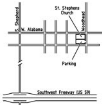
MAP: GETTING TO THE GENERAL MEETING

The web version of the Bayou Banner (which is a PDF file; see News at our web site) has some color pictures. You can print it on letter-size paper using the Adobe Acrobat Reader. After you click "Print", select "Reduce to Printer Margins" from the "Page Scaling" window. Make sure the printer Properties page is set for color. 🌐