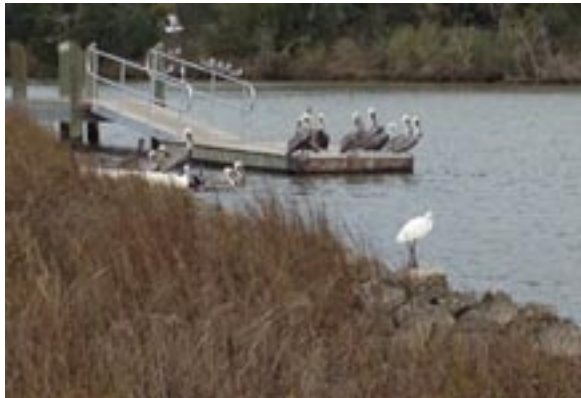
Welcome wagon at Oak Island