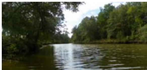
Hardwood Forest (Double Bayou)

Since the print copy of the Banner takes several weeks from editorial deadline to members' mail boxes, some late-planned activities appear only on the web site. 🌐