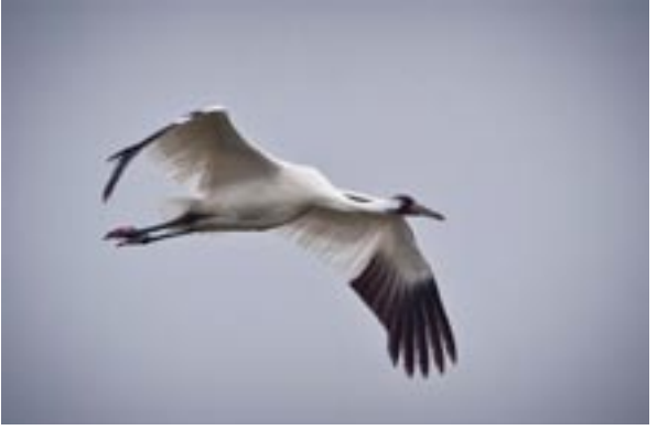
Whooping Crane flying

April 16, 2014 May 21, 2014 6:30 -9:00 PM