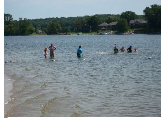
Swimmers at Lake Macbride State Park

Unfortunately you cannot look at the water and tell if it has high levels of indicator bacteria or microcystin toxins. Often the water is smelly, but not always. Green mats on the water indicate the presence of algae, but that alone does not indicate the presence of microcystin.