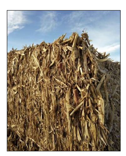
Bale of corn stover.

• Monitoring the use of stover in cellulosic ethanol production and the effects of the loss of stover on increased erosion and depletion of soil health. Stover, the residue left on the fields after the grain is harvested, includes stalks, leaves and roots; corn stalks, corncobs and the remains of soybean plants. Crop residues are beneficial for water retention in the soil, serving as carbon storage and providing soil nutrients, plus they keep silt out of our water bodies. The Chapter supports developing standards and guidelines that reduce the effects of stover loss.