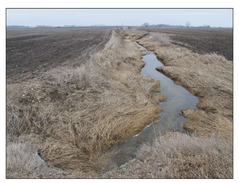
Stream buffer.

• Implementing the above policies accompanied by aggressive enforcement and stiff penalties for violations.