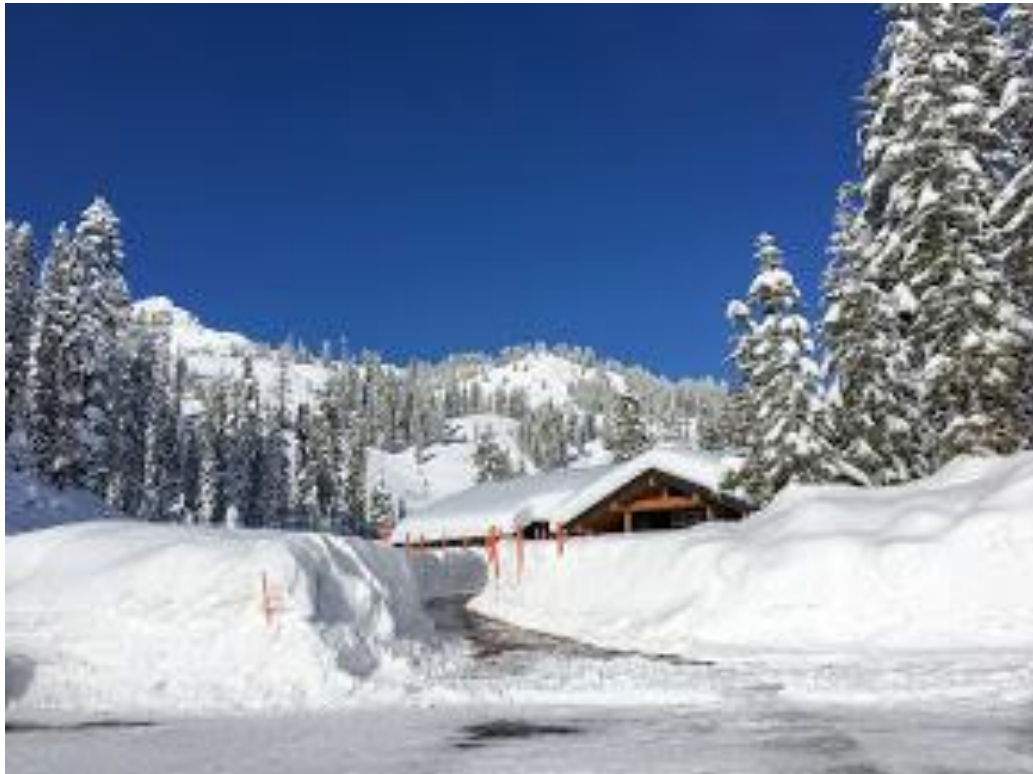
SUNDAY MORNING VIEW FROM CAMP