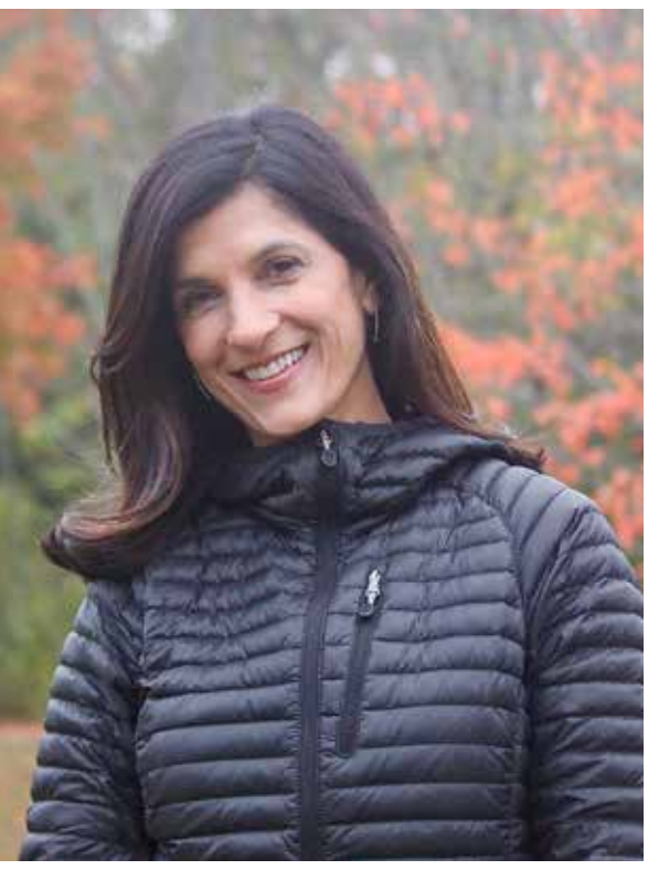
U.S. Senate candidate Sara Gideon and presidential candidate Joe Biden will put the country on the right track for solving the multiple crises of climate, the pandemic, systemic racism, and economic inequity.

health, our water, our public lands, and our wildlife.