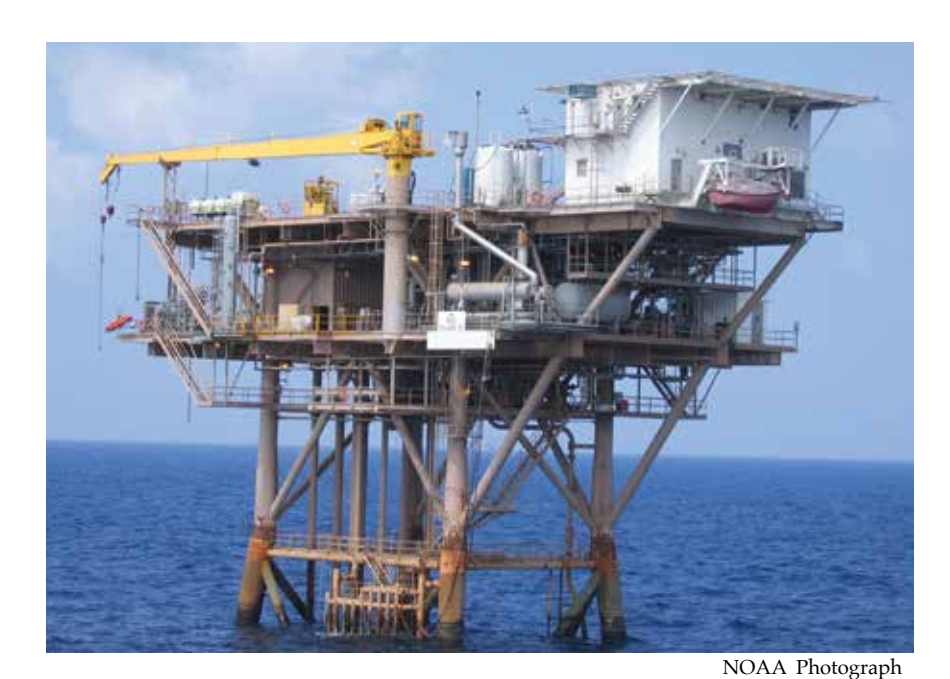
By Stopping This