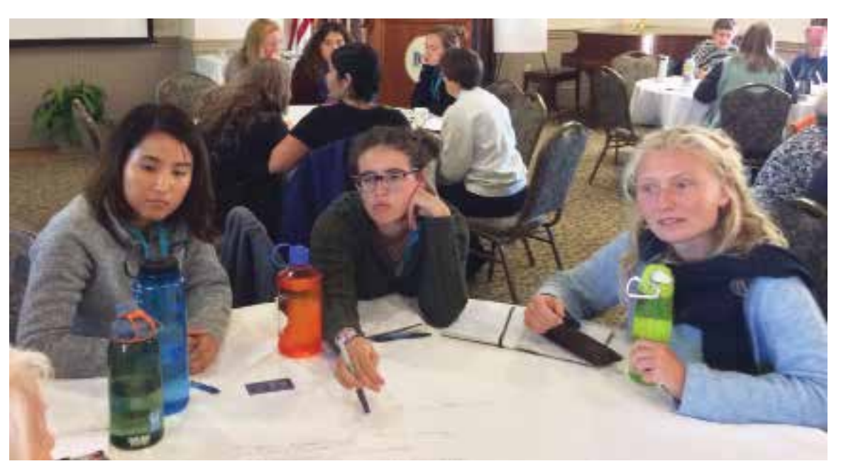
Among the 100-plus summit attendees were a good number of students from College of the Atlantic.

In another address, Michelle Sanborn of the New Hampshire Community Rights Network emphasized citizen-based action to protect the rights of communities and the rights of nature. As with Hous-