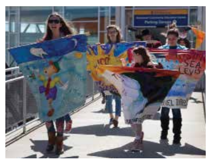
Concerned youth were a big part of the Portland event.

The Summit underscored the urgency of the climate threat by mobilizing and giving voice to real people in real communities already facing stark threats.