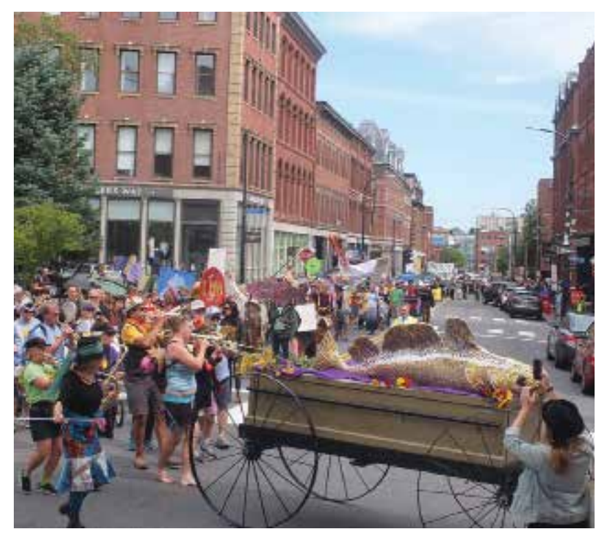
One of the highlights of the Portland event was a funeral march emphasizing the effects of climate change on Maine fisheries. lature and governor in Maine committed to further reducing

The Portland March was part of a worldwide mobilization that took place just days before the Global Climate Summit in San Francisco. The Summit brought leaders together from around the world—celebrating achievements and calling for even deeper worldwide commitments and accelerated action from all countries.