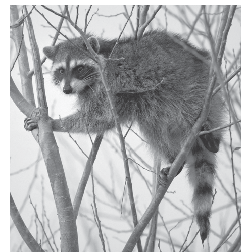
Images of Maryland animals of all stripes, courtesy U.S. Fish and Wildlife Service