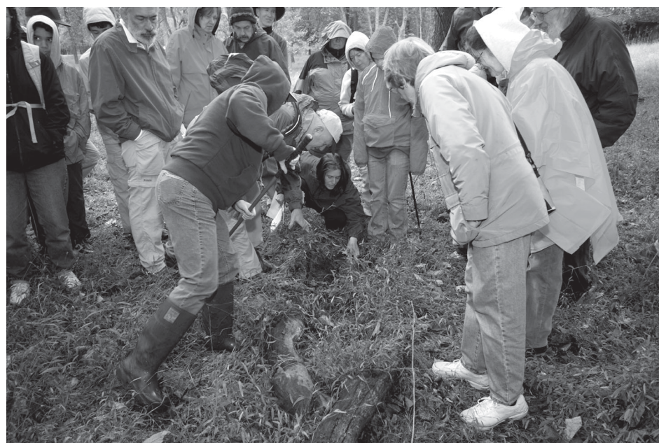
"Bio-blitz" draws Jamboree participants to an exploration of the flora and fauna around the camp.