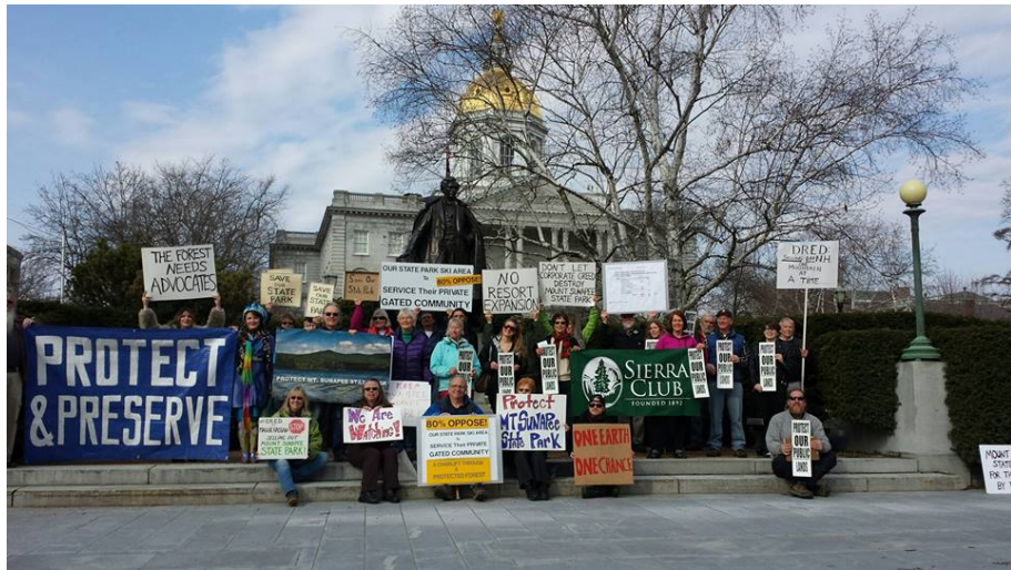
Rally for Mt. Sunapee in front of the State House, Concord, NH - March 2016

this state owned public land live some of the oldest forests in the state, and definitely in Sullivan and Hillsborough Counties. By their nature, the habitats are unique and rare in New Hampshire and we are lucky to have them on public land. The plan proposed last year would add a new chairlift, new ski trails, new lodge, a roller coaster, more parking and new amenities.