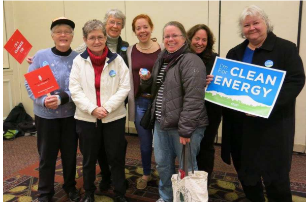
Newly Trained "Team NHSC" in Action at Climate Rally Saturday, December 19, at the Radisson Hotel, Manchester.

We now have several individuals who will be acting as Team Leaders throughout the state during the final weeks leading up to the February 9, 2016 Primary, but they can't cover all the bases alone. As you would expect, many events will be scheduled as the candidates vie for visibility and support; your help is needed to keep our message up front, and to ask the questions that will put their positions regarding environmental issues on record. The more volunteers we have at these events, showing the media and the candidates that NHSC members are serious about climate issues, the better chance we have of forwarding our agenda.