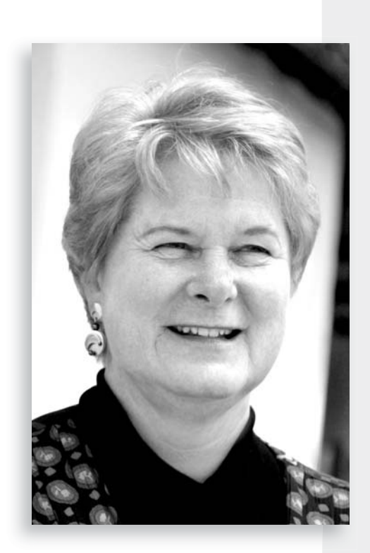
Peg Pinard Candidate for California State Senate District 15