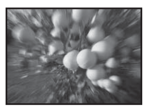
Approaching the unknown: Big Agriculture is pushing GE crops at maximum speed, despite a complete lack of data on long-term human health effects and against mounting evidence of inevitable environmental disaster.

Placing the world's food security and the fate of farmers in the hands of the Monsanto Corporation clearly is not the way to go. The better way has long been known. To underscore the point, Sierra Club's National Sustainable Consumption Committee has launched the "True Costs of Food Campaign," a grassroots, community-based campaign to promote "low-impact foods" — locally grown, organic, and fetching a price premium for farmers two to seven times the price of their genetically engineered counterparts. But only so long as they remain uncontaminated by genetically engineered seeds and pollen.