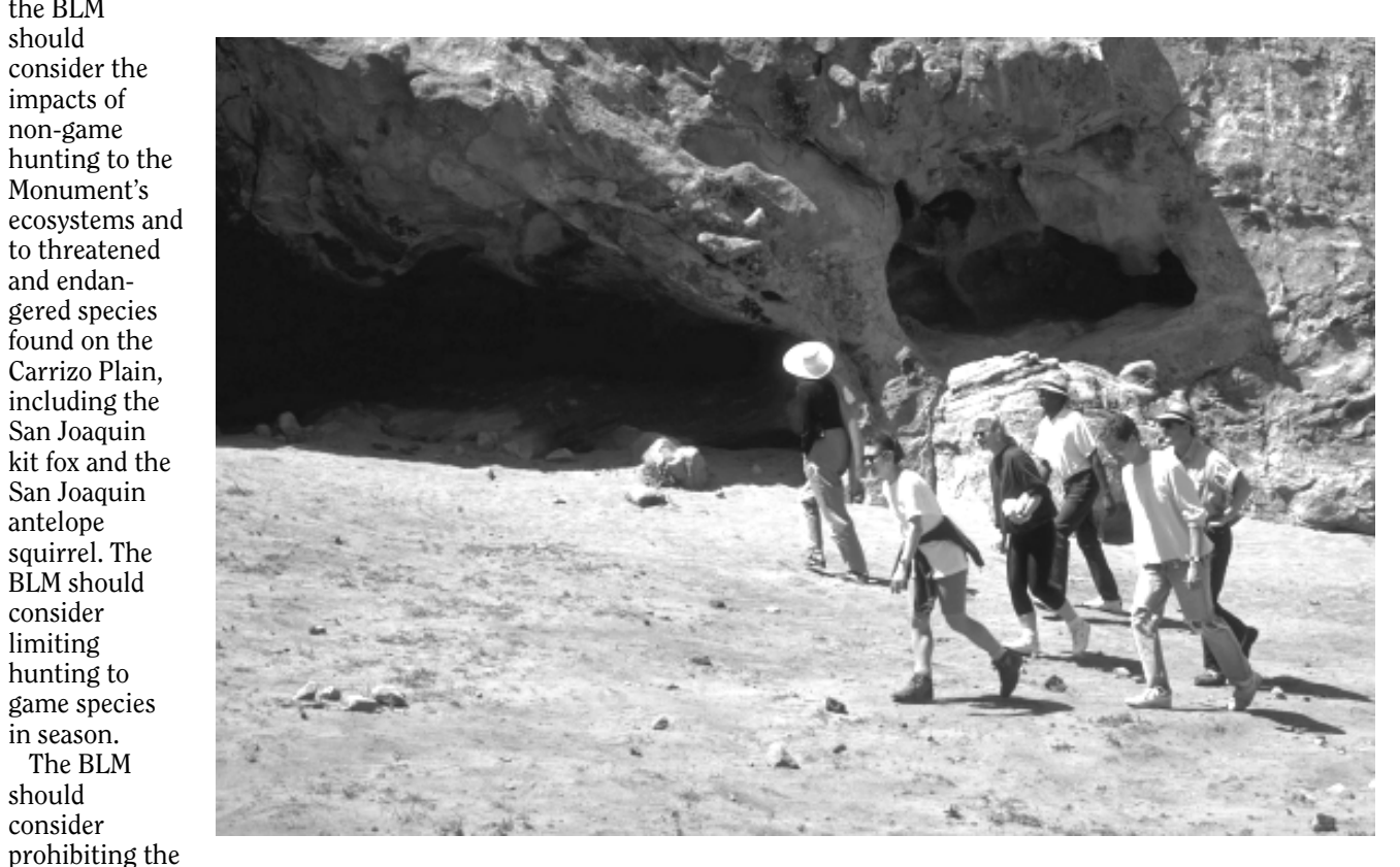
Tell the BLM: Painted Rock should be preseved and restored.

CPNM RMP Bureau of Land Management 3801 Pegasus Drive Bakersfield CA 93308