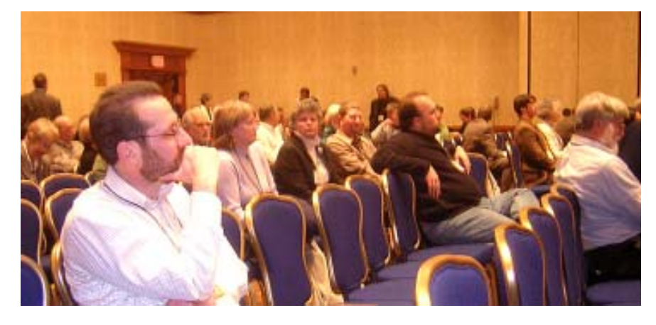
Bull session: The Sierra Club delegation gathers for a conference re-cap.

Good Jobs and Start Building a Low-Carbon Economy put it, writing in the February 16 issue of The Nation, "The transformation to a clean energy economy can...serve as a major longterm engine of job creation [and] can also become a cornerstone of a longterm full employment program in this country, which in turn will be the most effective tool for moving people out of poverty and into productive working lives. In short, the transition to a clean energy economy has the capacity to merge the aims of environmental protection and social