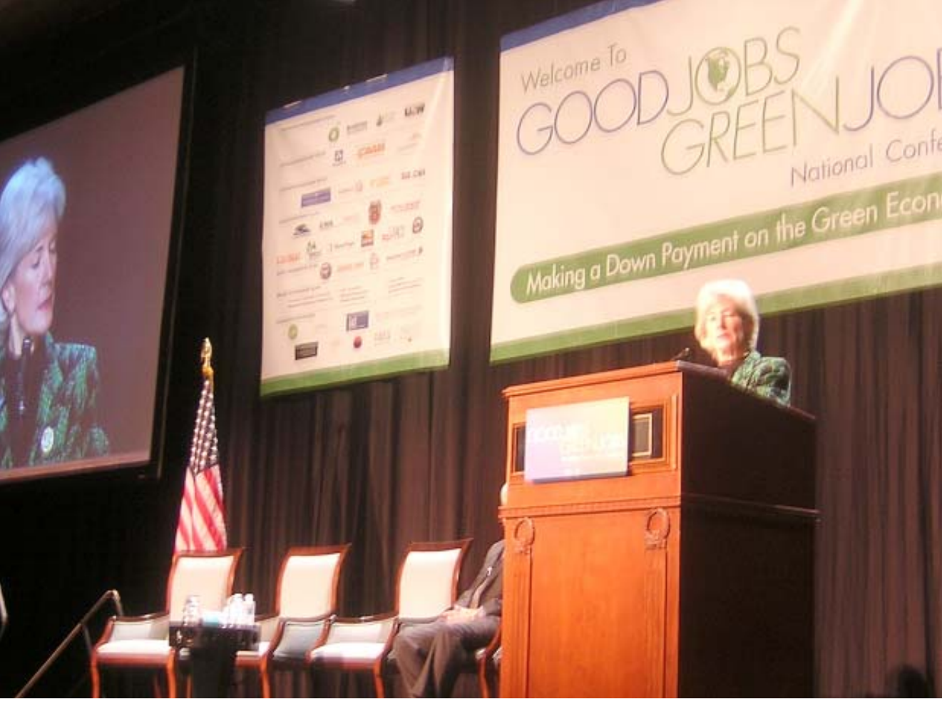
Nothing the matter with Kansas: Kansas Governor Kathleen Sebelius told the story of how her state became the first in the nation to cancel plans for a coal-fired power plant due to concerns over greenhouse gas emissions.

coalition that supports the transition to a clean, renewable energy economy