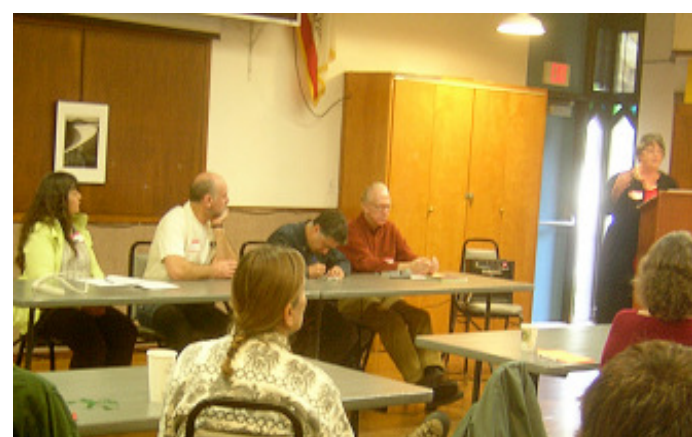
over ten years each, and ongoing – and the complexity of the issues.

The three case studies were chosen for the