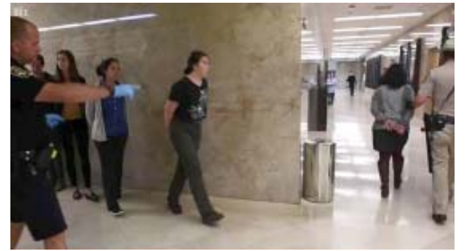
This way to jail The author and friends leave the Governor's office.