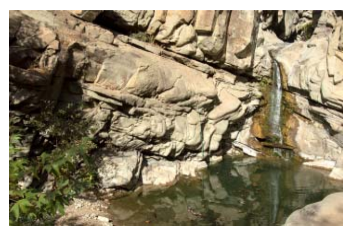
Oil or water Waterfall in Santa Paula Canyon.

Donate or volunteer for voter outreach, fundraising, house parties and more at protectslo.org , or (805) 994-0076.