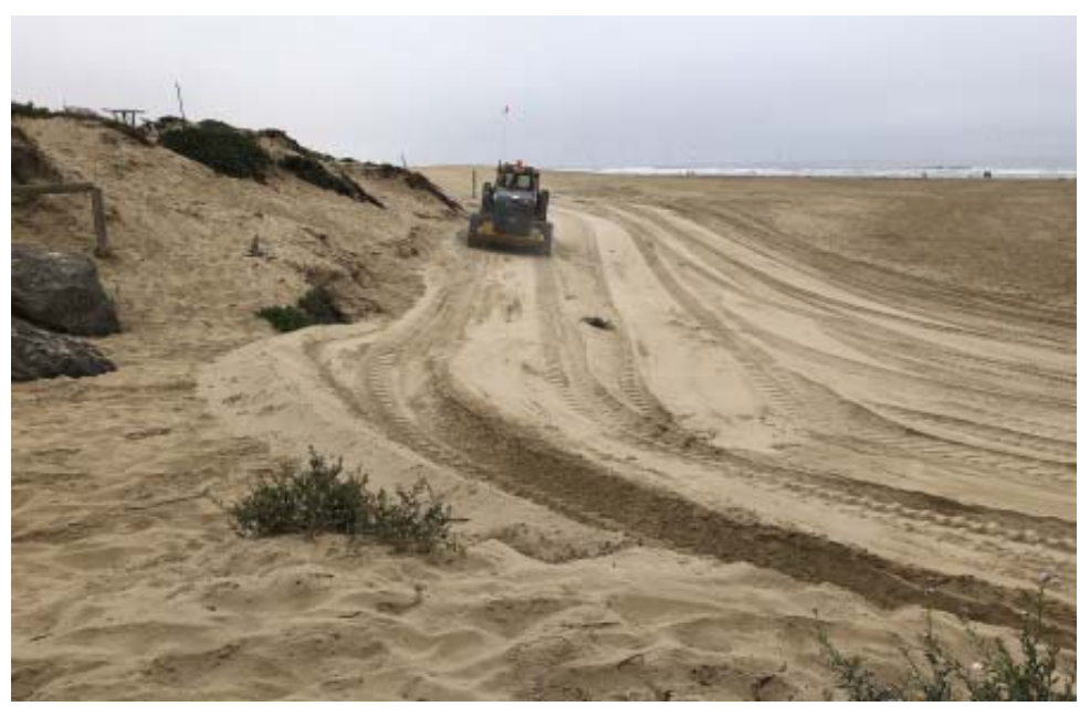
Extra-legal The recent significant increase in grading at Oceano Dunes requires a Coastal Development Permit. State Parks hasn't sought one, adding to its list of Coastal Act violations at the dunes.