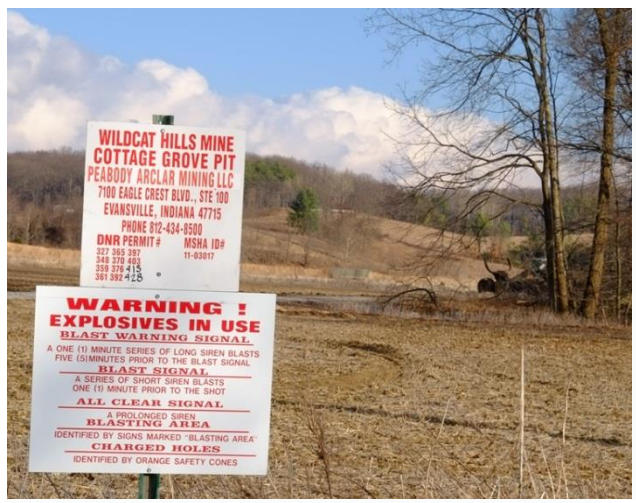
Explosives warning sign posted on March 12th near the logging entrance, prior to a 401 permit being filed-stamped at the Saline County Courthouse on March 13th.

during a peaceful assembly on county property documented by <u>KPSD Channel 6 news</u>, during which an elderly resident was verbally assaulted by Peabody staff.