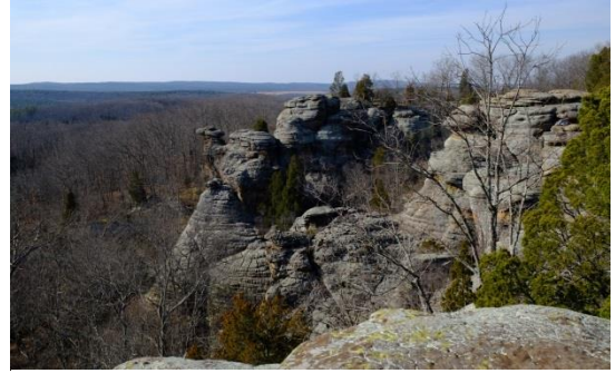
Garden of the Gods. Photo by Sabrina Hardenbergh, 2014

<u>Future Outings TBA</u>: We have two soon-to-be certified outings leaders who plan to hold outings in the fall. Check our "Outings" page for updates: <a href="http://illinois.sierraclub.org/shawnee">http://illinois.sierraclub.org/shawnee</a>