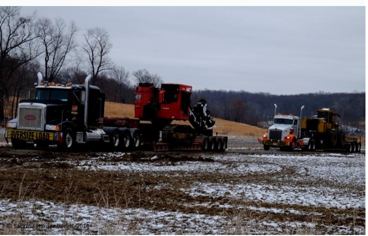
Over-loaded semis carrying tree fellers for logging Peabody's proposed Rocky Branch Mine site.