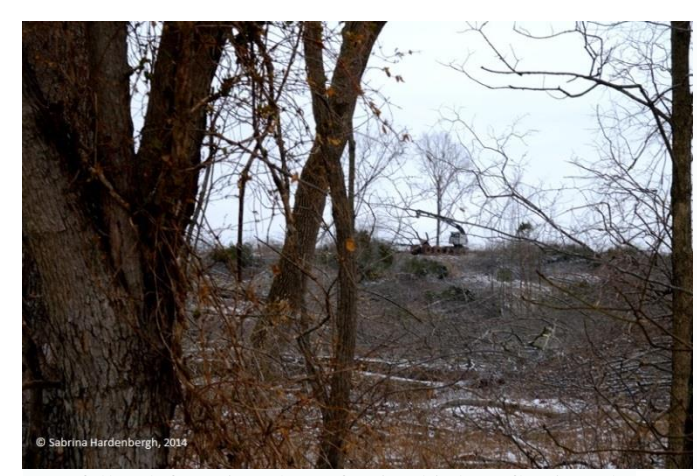
Tree feller deforesting slope, forcing birds to flee into the remaining tree line along the neighbor's property line.