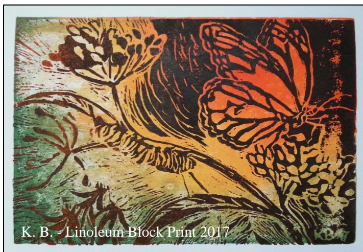
K. B. - Linoleum Block Print 2017

When spring arrives, there’ll be plenty of opportunities to help Monarchs and other pollinators. Check out our info table at the Shawnee Sierra Club’s spring native plant sale. In addition to our projects, the Friends of Crab Orchard Wildlife Refuge welcomes volunteers at their Pollinator Habitat Project at Harmony Trail.