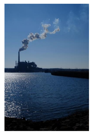
Lake of Egypt Power Plant. Sabrina Hardenbergh, 2014

The <u>National Rural Electric Coop Association</u>, in which southern Illinois' various rural electric coops are members, has a counter <u>Cooperative Action Network</u> campaign, which is lobbying against the Clean Power Plan. This action network argues against the Plan, saying that it will threaten jobs and increase rates, but such southern Illinois coops appear to be aligned with the <u>coal industry</u>. Coal and nuclear energy are Illinois' predominant energy sources. Our rural electric coops incorporate <u>renewable energy and smart grid capacity</u> in an "all of the above" approach to their <u>fuel portfolio</u>, in which coal plays a major role, and in which natural gas and nuclear energy are included.