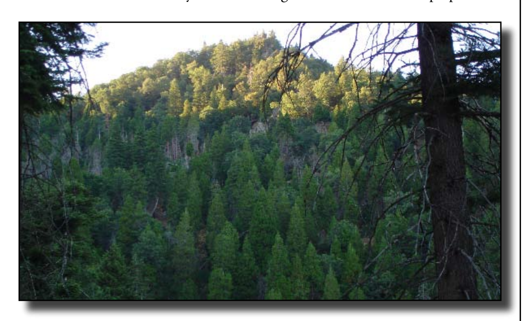
Saved from logging! Cold Springs Peak, inside Saddle Sale unit 161.

We are outraged that the Forest Service did not take seriously its responsibility to protect this wondrous forest. The Sierra Club has another lawsuit pending, which challenges the Forest Service's Sequoia Monument Management Plan, because it perpetuates