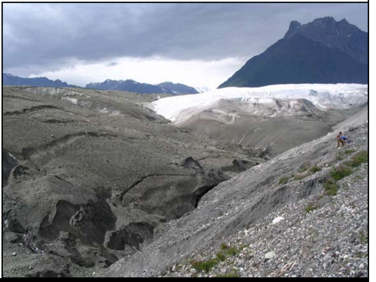
Explore, enjoy and protect the planet