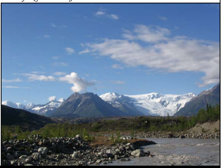
Toe of Kennicott Glacier