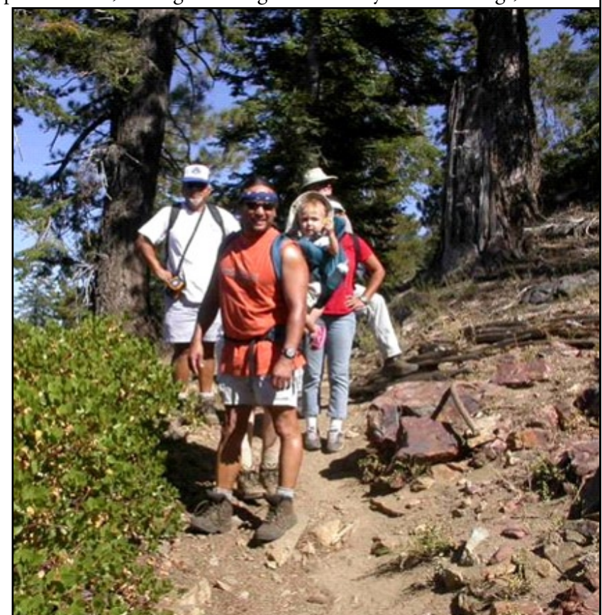
Explore, enjoy and protect the planet

If you see a hike that interests you, please call the outings leader and verify if it is suitable for your child's age group, as factors such as terrain and distance may render age requirements on some outings. *