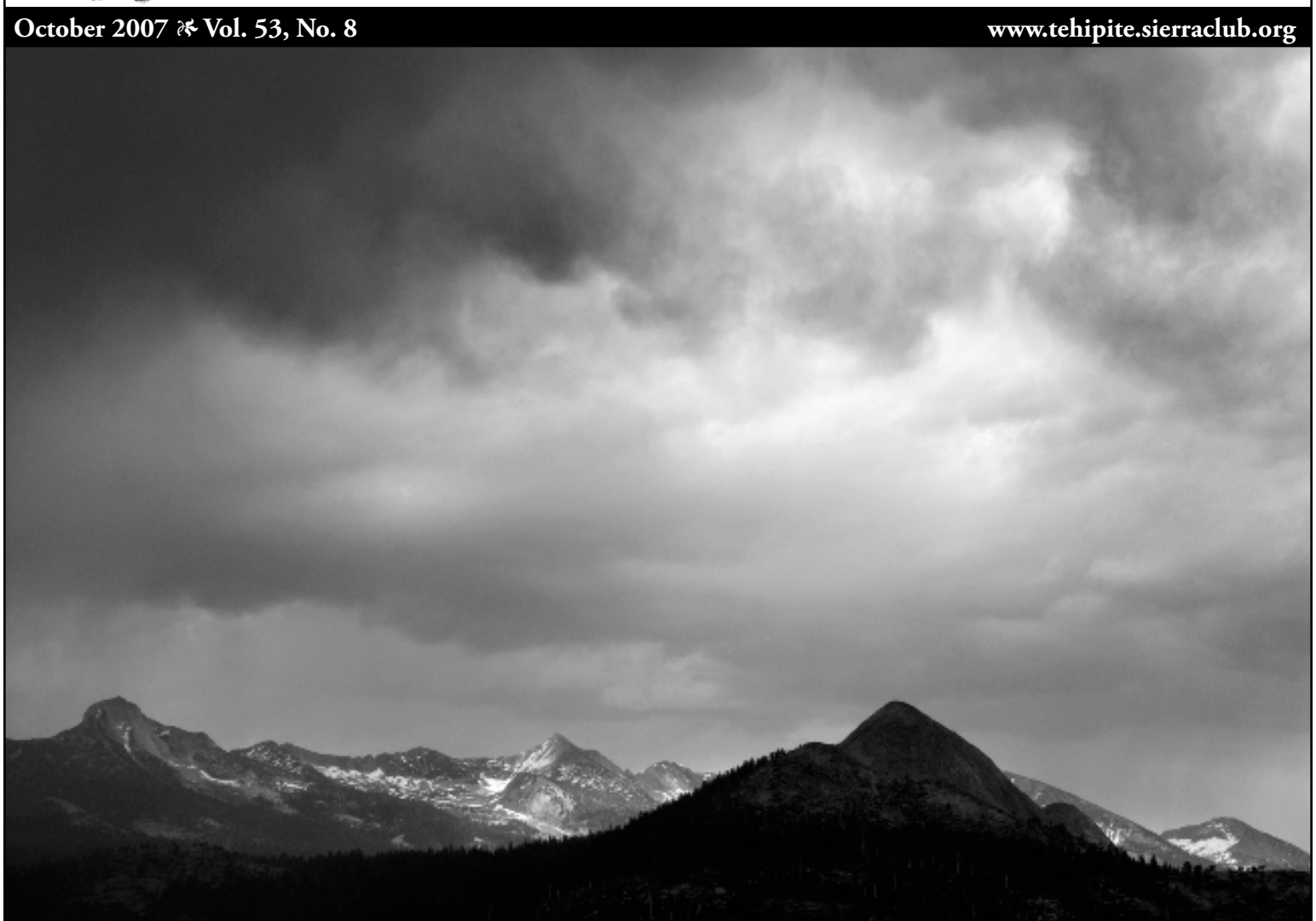
Thunderstorm, Mount Starr King and Clark Range, Yosemtie National Park, California, 2007