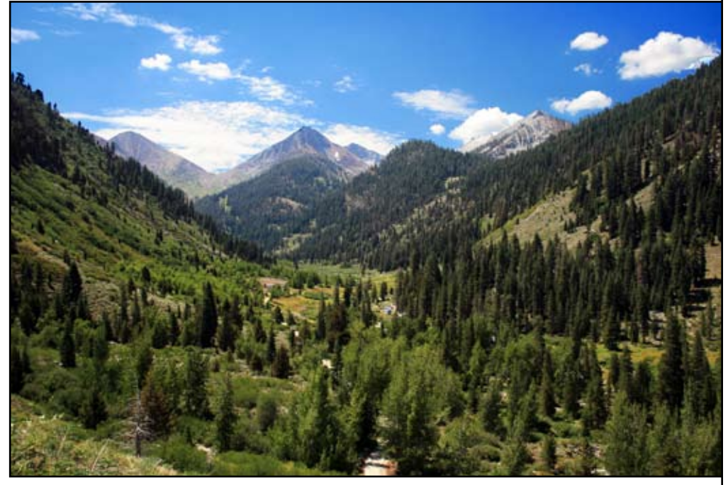
Mineral King Valley

In 1965, the U.S. Forest Service issued a prospectus calling for proposals to develop a ski complex in Mineral King. Walt Disney Productions won the competition with their proposal to build a massive development consisting of numerous ski runs cleared through the forests; hotels, gift shops, and restaurants in the valley bottom; and mountain-top restaurants located on the Sequoia National Park boundary, so diners could have a "wilderness experience" as they sipped their aperitifs. The plan included a snow avalanche management program to ensure that nature did not get the upper