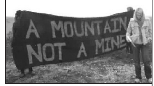
Earth First! banner displayed at Jesse Morrow Mountain