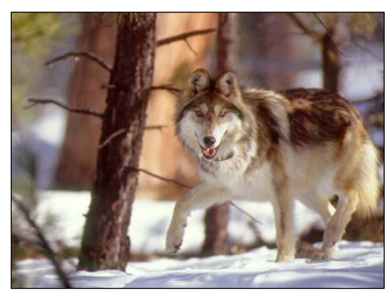
WITH ONLY 58 LEFT IN THE WILD, THERE IS NO NORTH AMERICAN LAND MAMMAL MORE ENDANGERED THAN THE MEXICAN GRAY WOLF. LIVING IN THE REMOTE MOUNTAIN FORESTS AND GRASSLANDS OF ARIZONA AND NEW MEXICO, NO ONE HAS SIGHTED A WILD WOLF SOUTH OF THE BORDER SINCE 1980.

controversial wind project in a sensitive area of the Sierra has been found threatening to endangered California condors and golden eagles. While more than 700 species have qualified for protection, 3,000 imperiled species await official decisions, and 600 eligible candidates deserving protection may have a long wait. Meanwhile, the Wise Use movement, a powerfully funded, industry-based coalition of developers, timber-mining-oil companies, agribusiness firms, large water users, and offroad vehicle manufacturers has mounted a massive campaign to undermine the ESA, and Congress is working to slash current funding.