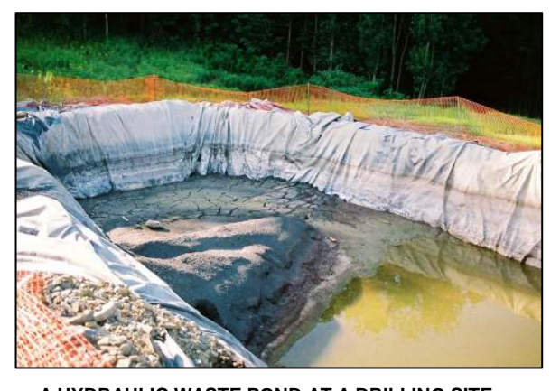
A HYDRAULIC WASTE POND AT A DRILLING SITE — IS THE GROUNDWATER ADEQUATELY PROTECTED?

Fresnans Against Fracking faces a daunting task in convincing Fresno County residents to support making the Valley a "Frack-Free Zone." We are up against a popular political will to embrace any enterprise that guarantees the creation of new jobs when their local economy is depressed, regardless of adverse social and potentially dangerous environmental consequences. Without adequate insight into the risks fracking poses to invaluable natural and social resources, current hardships will send the public running headlong into a disastrous future.