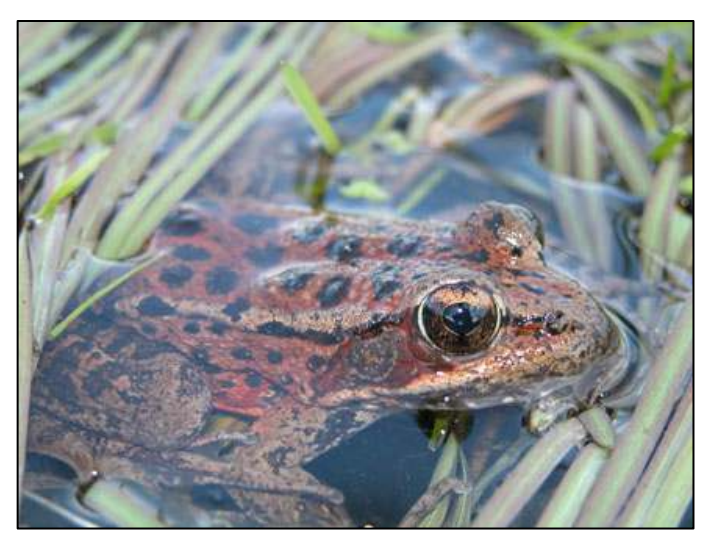
DEGRADED WATER QUALITY FROM AIR AND SURFACE POLLUTION THREATENS MANY SPECIES OF AMPHIBIANS, INCLUDING THE CALIFORNIA RED-LEGGED FROG.

The Endangered Species Act (ESA) of 1973 has saved many species such as the red wolf, the whooping crane, and the peregrine falcon from imminent extinction. Fortunately, our national bird, the bald eagle, has also made a comeback after being shot, electrocuted by power lines, and poisoned by ingesting shotgun pellets. A