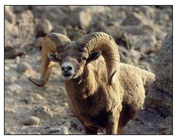
A PNEUMONIA OUTBREAK, BELIEVED TO HAVE KILLED TWENTY ENDANGERED BIGHORN SHEEP THIS PAST MONTH IN MOJAVE NATIONAL PRESERVE, THREATENS HUNDREDS IN THE STATE'S BIGGEST HERD AS WELL AS MANY MORE IN NEARBY NEVADA.

Growing up in Metropolitan Southern California, the only wildlife I remember seeing were the gophers and moles who plagued our garden, an occasional house mouse, and a variety of common scrub jays, robins, blackbirds, doves, and mockingbirds. Later, as a young parent living in the Sierra foothills, I cultivated a more intimate relationship with the local flora and fauna. Once, a red-tailed hawk flew close over my shoulder; another time I froze mid-step, confronted by a bobcat a few feet away, with only a window pane between us. We communicated silently for a few minutes before he went on his way, searching for our cat as a meal. At night, I would often see mule deer in my headlights and would stop to "converse" until they moved. On rare occasions, I heard coyotes howling their wild, ecstatic song.