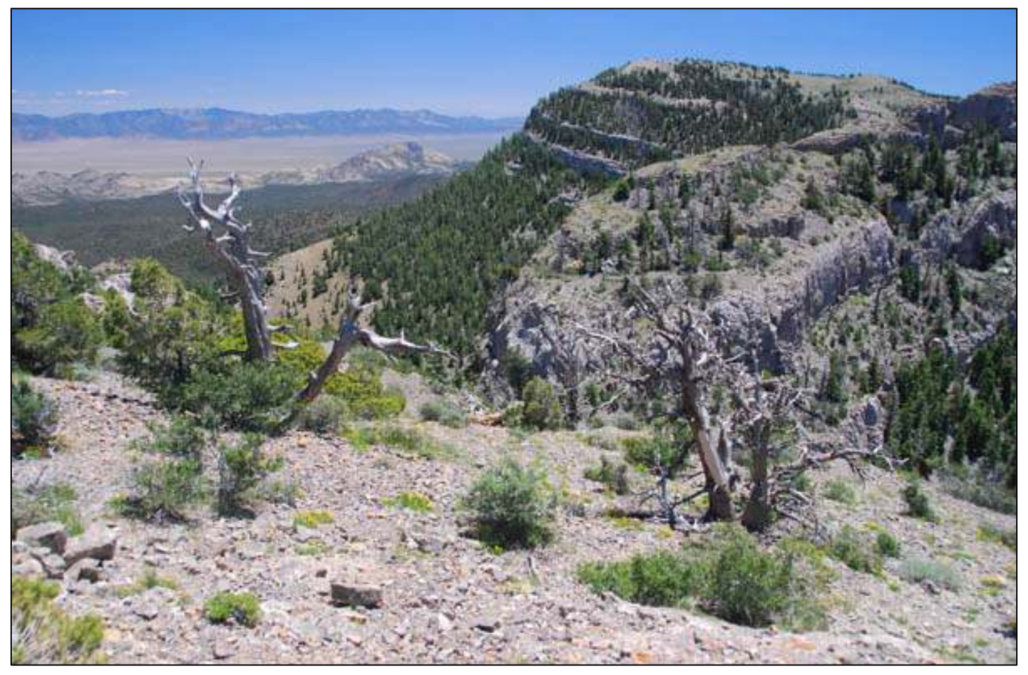
MOUNTAIN HOME RANGE