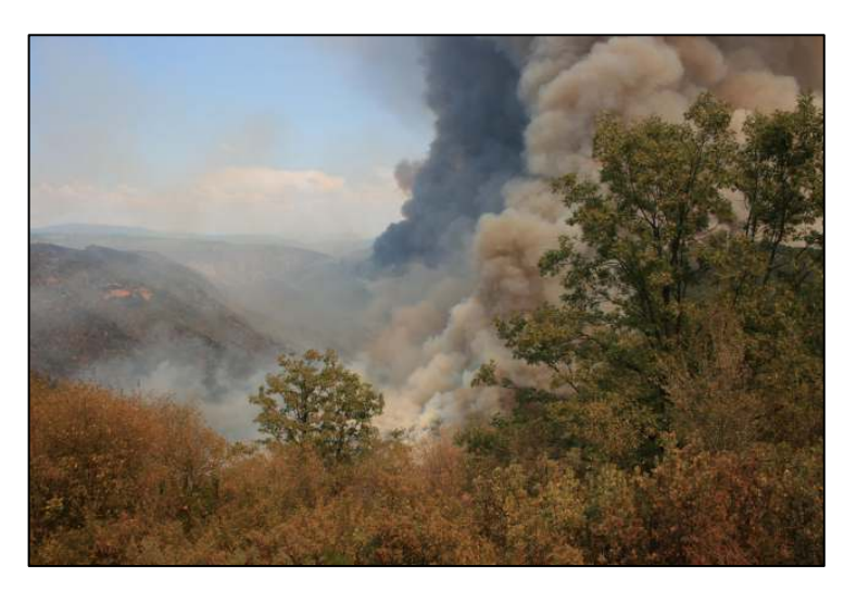
THE RIM FIRE BURNS IN TUOLUMNE RIVER CANYON BELOW YOSEMITE.

As you probably already know, the Rim Fire started on August 17 in the Stanislaus National Forest, west of Yosemite National Park. To date (September 26) it has a footprint of 257,134 acres (402 square miles), not all of which was burned. It is still burning, but is 84% contained. The current burn is mostly "good" fire, doing what fires are expected to do in southwestern dry mixed conifer forests, clearing the dead fuels and thinning small trees and shrubs, and returning nutrients to the soil. According to recent news reports, Rim is the third largest wildfire in California history. Severity of burn to vegetation is about 38% high severity, 27% moderate, 24% low, and 11% unchanged.