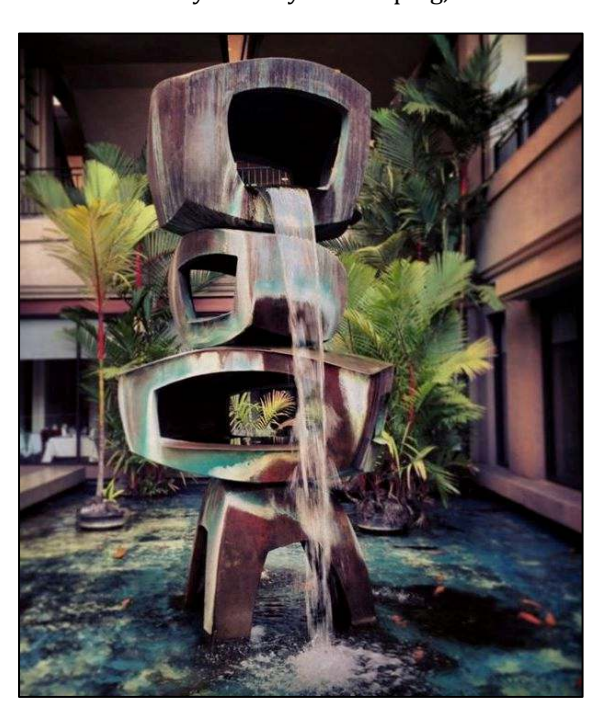
ANY LARGE INTERIOR PUBLIC SPACE WILL BE ADORNED WITH ART, ENHANCING THE TRANSITION FROM INSIDE TO THE ART OUTSIDE ON THE MALL.

As I am neither an architect nor an urban planner by profession, nor much of an artist either, my part in this effort at crowdsourcing will be to facilitate an architectural competition to create a more fleshed-out face for the Fulton Green Project. In this city and up and down the state are new students and skilled professionals in the fields of green architecture, environmentally friendly landscaping, and sustainable urban design, as well as many talented and capable artists, who can