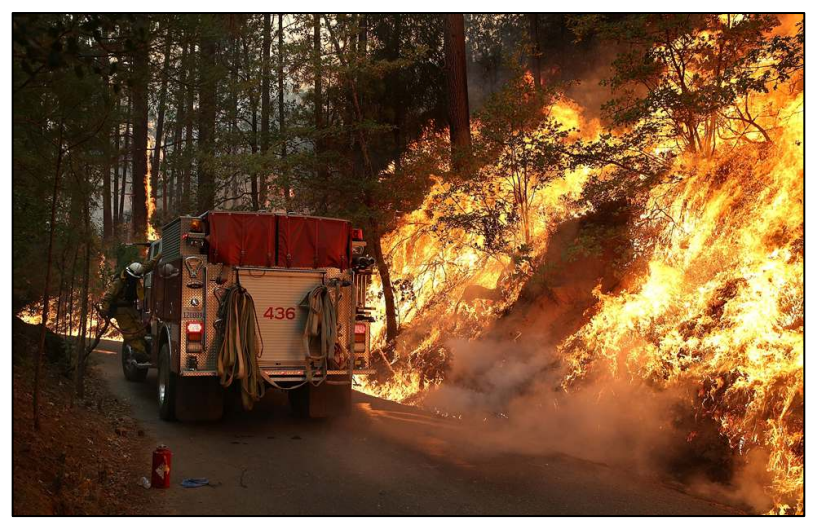
WISE FOREST MANAGEMENT, WHICH INCLUDES ALLOWING FIRE TO PLAY ITS NATURAL ROLE IN MAINTAINING A BALANCED ECOSYSTEM, WILL SAVE THE PUBLIC MILLIONS OF DOLLARS NOW SPENT ON FIGHTING CATASTROPHIC FIRES, AND IN THE END WILL PUT FEWER FIREFIGHTERS IN HARM'S WAY.

Soil burn and veg burn are different; and in fact, both sets of numbers are way out of the norm. So while "catastrophic," with its emotional connotations, may not be a useful term for fire in a scientific context to describe Rim, "uncharacteristic" is more appropriate since this fire is outside the natural range of variation for levels of severity in pine dominated mixed conifer dry forests. "Natural range of variation" just means that for this