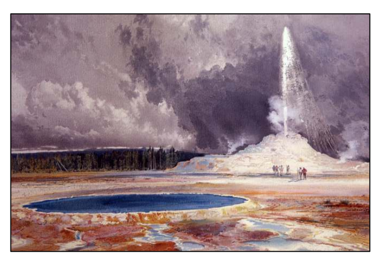
AS GUEST ARTIST ON THE HAYDEN GEOLOGICAL SURVEY OF 1871. THOMAS MORAN SKETCHED MASTERFUL WATERCOLORS THAT COMPLEMENTED THE PHOTOGRAPHS OF WILLIAM HENRY JACKSON TO CONVEY TO A SKEPTICAL PUBLIC THE TRUTH AND BEAUTY BEHIND THE SEEMINGLY FANTASTIC TALES ABOUT STEAMING RIVERS, BOILING FOUNTAINS, BUBBLING MUD, AND PETRIFIED TREES ON THE YELLOWSTONE PLATEAU. ONE YEAR LATER YELLOWSTONE BECAME AMERICA'S FIRST NATIONAL PARK.

The land was largely a virgin wilderness, but early settlers viewed it as a dark, fearful place of savage beasts needing to be tamed. Pioneers, in the quest for civilization, were busy altering the landscape with farms and cabins, while artists were busy portraying it. As the land became more settled and cultivated, wilderness became more scarce, and conservation-minded individuals saw what was being lost, recognized the beauty of the land as painted by artists and printed by photographers, and spoke out about the importance of wild lands as a major part of our nation's heritage.