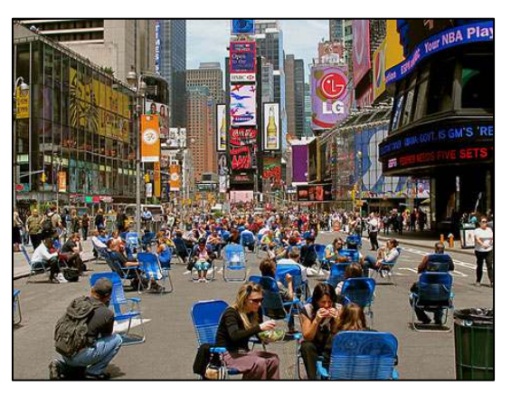
EVEN NEW YORK CITY'S TIMES SQUARE HAS BECOME A CAR-FREE ZONE

Road Mall, Boston's Faneuil Hall Marketplace, Santa Monica's Third Street Promenade, San Diego's Horton Plaza, the Fremont Street Experience in Las Vegas, the River Walk in San Antonio, and Oklahoma City's East California Avenue, alongside the Bricktown Canal. Then there are the hybrid transit malls like Denver's 16th Street, Minneapolis' Nicollet Mall, and Memphis' Main Street transit corridors. In our own neighbor city Clovis, farmers markets, antique fairs, and sporting events like bike races and the annual pole vaulting competition turn Old Town's Pollasky Street and several of the side streets into a highly successful pedestrian-only venue on a frequent basis throughout the year.