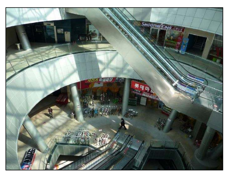
THERE IS NOTHING PARTICULARLY FANCY ABOUT THIS JAPANESE VERTICAL MALL, BUT NOTICE ALL THE BICYCLES PARKED ON THE GROUND FLOOR. OTHER COUNTRIES ARE NOT SO RELIANT ON CARS.

Because people live in the structure, there will be all of the services necessary for neighborhood life, such as a grocery store, bank or credit union, laundry, barber, health club, perhaps a branch of the county library, and other such prosaic establishments. But with people coming from the entire metropolitan area, and even beyond, this is also be the best place