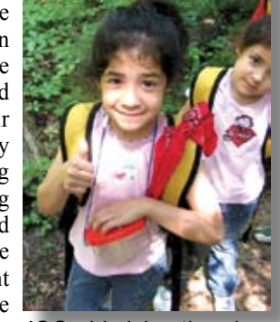
can always gain ICO girl giving thumbs -from more up! friends to share and enjoy outings with.

more about our program. We have more than a dozen people who've decided to share in their time and energy in co-creating and developing our group and outings. We're off to a decent start. And we can always gain