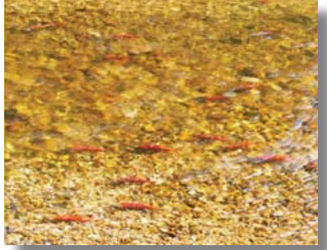
Kokanee salmon in Robinson Creek, near Bridgeport.

They're Kokanee salmon and are the only salmon that live their entire lives in fresh water. Initially discovered in some freshwater lakes of the Pacific Northwest, the Kokanee (an Okanagan Native American word