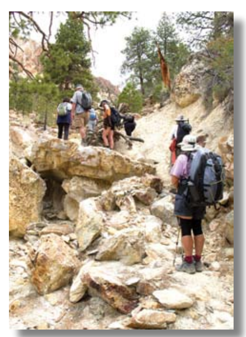
Heading up to Black Eagle Camp on our Spark Plug Mine adventure.

Come join us and enjoy a day hiking, exploring, and learning about the wonderful Eastern Sierra. See the outings calendar on pages 4-5 or go to <a href="http://nevada.sierra-">http://nevada.sierra-</a> club.org/rolgroup/> for the latest updates.