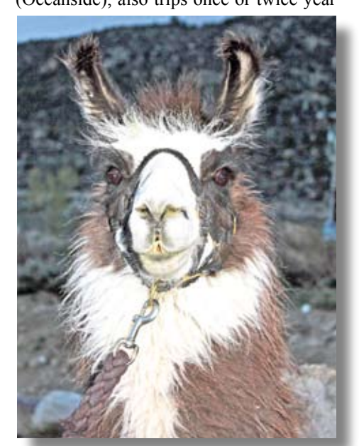
One of the two hikers' friends who visited our May 17 Program Meeting.

ly field trips for Buena Vista Audubon (Oceanside), also trips once or twice year