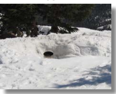
The Benson Hut stovepipe rises above the two-story building — but in this photo, only the top of the pipe is visible above the snow in early April.

After this past winter, the huts are going to need more than the usual attention. Benson Hut, for example, will need a new cap for its stovepipe (see photo); Peter Grubb Hut needs roof repairs, in addition to replacement caps for its two stovepipes.