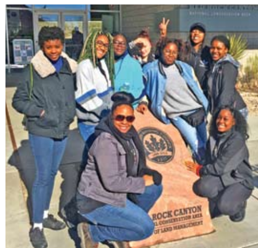
Queens of Calico Hills.

created when supercooled water droplets coat a snowflake