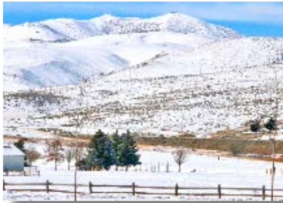
Snow-covered Peavine Mountain from Reno's Rancho San Rafael Park in mid-February '19.

As of this writing on March 1† the Truckee River watershed stood at 141% of average precipitation and Lake Tahoe at 136% of average. Lake Tahoe rose over a foot during February, much of it from precipitation directly on its surface. If the Sierra and western Nevada