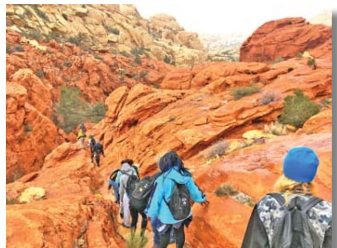
Conquering a challenging trail.

As one participant exclaimed, "I feel like I'm in another country." The girls broke into song on a few occasions -- motivational type camp songs. This brought smiles to the faces of other hikers who were passing by. One