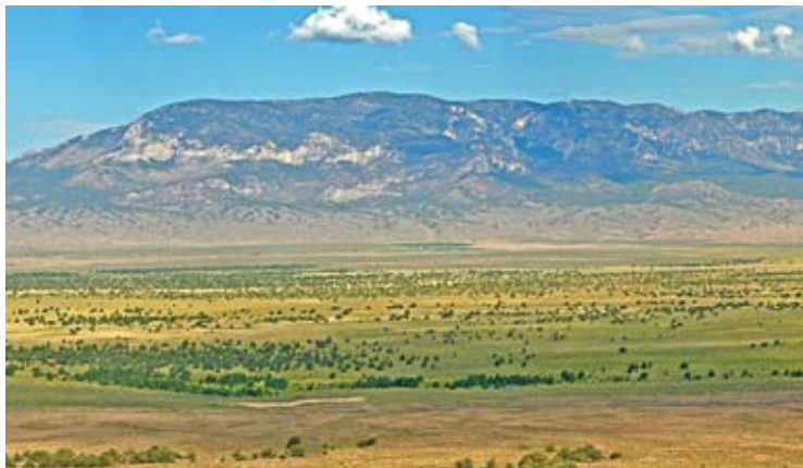
Spring Valley looking west toward the Schell Creek Mountains near Great Basin National Park. Spring Valley contains numerous springs and an extensive grassland dotted with Rocky Mountain junipers supported by the high groundwater table.

What you can do. For more information on the Nevada water wars, follow this link to the GBWN website: http://greatbasinwaternet-work.org .