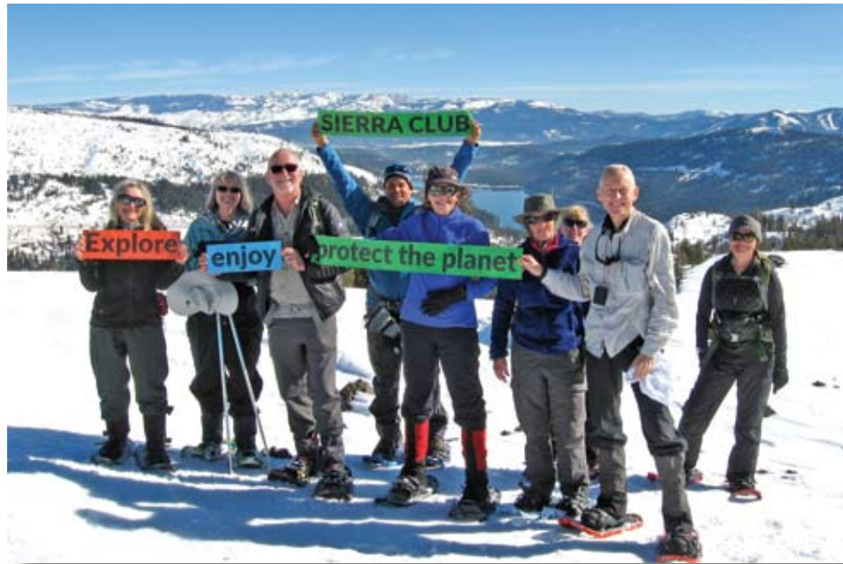
In January, a Great Basin Group snowshoe outing used the Club's Claire Tappaan Lodge as a base. The climb to the top of Boreal Ridge and view of Lake Donner was outstanding. (See snowshoeing article on page 3.)