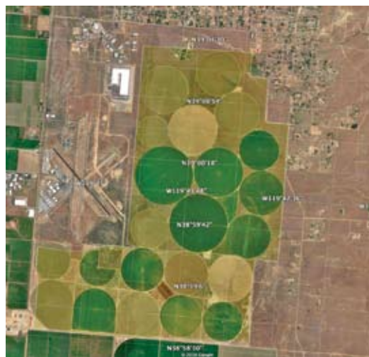
These Carson Valley groundwater supplied pivots first appeared in 1999 just 2 miles from the Carson River and expanded quickly to the 22 pivots (about 2,900 acres) seen in this 2019 Google Earth™ image. Consumption of groundwater for these pivots could be as much as 10,000 acre-feet of water per year or 200,000 AF over 2 decades.

Over the decades, the NV State Engineer (NSE) has allowed groundwater users to over-appropriate as many as half of Nevada’s hydrographic basins. Early on, most water used in the state came from surface waters such as the Truckee or Humboldt Rivers, smaller streams which flowed from the state’s numerous mountain ranges or from local or large regional springs. Later,