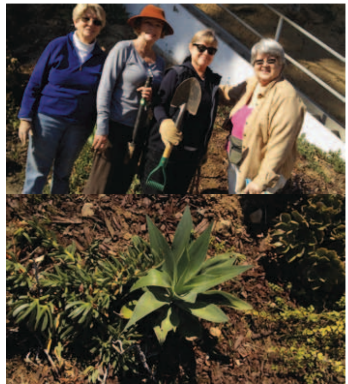
The gophers are the biggest problem right now. We need more raptors, coyotes, and owls! Also, a water source while our plants get started.

Last winter and spring we installed plants that can survive with lots of sun, and scattered wildflower seeds. Now we're back working in the garden again. Trying new species, and nurturing the ones that are doing better.