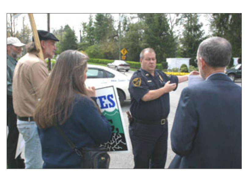
Security at The Greenbrier explains demonstration restrictions to Fossil Fools activists. (see story, page 1)

For more information, contact Jim at: jimscon@gmail.com or <u>304-698-9628</u>.