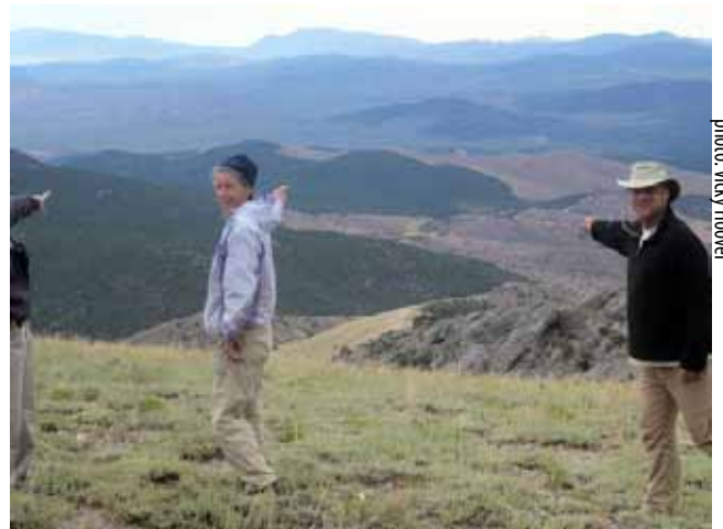
Distant views abound in eastern Nevada wilderness: Becky Peak, Schell Creek Range

We Wild Nevada activists invite you to come and visit our wonderful wilderness. ☺