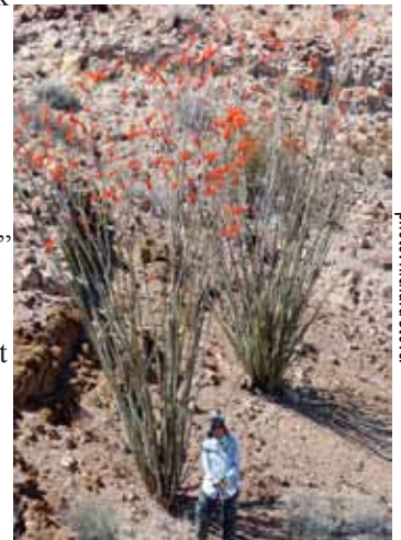
Giant ocotillo blooming in the Turtles

and improve a previously constructed trail leading around the dramatic "Mexican Hat" volcanic rock formation. BLM had built the trail after our group, on an earlier service trip, had walked through the