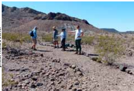
Trail defining in the Turtles