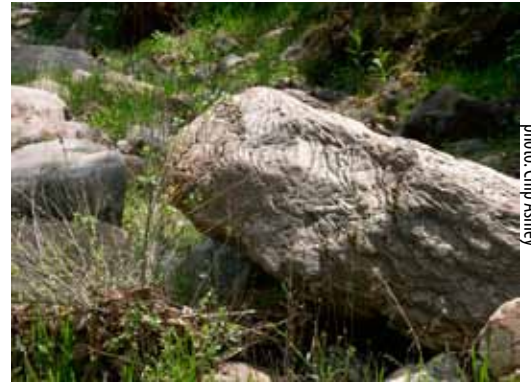
Cats Head Mountain WEA: Metamorphic boulder, Kings River ophiolite, along Deep Creek

Monarch Wilderness Addition (Sequoia & Sierra National Forests) – This 54,000-acre potential addition to the Monarch Wilderness encompasses the Kings River roadless area and a segment of the Kings Wild & Scenic River, as well as the unprotected 12-mile segment of the Kings downstream. The river is also a state-designated Wild Trout Stream. The Kings River has carved one of the deepest canyons in North America. Rich in biodiversity, this wild gorge rises from 1,000 feet elevation to more than 10,000 feet and is an important transition area from the higher Monarch Wilderness and Kings Canyon National Park down to the oak woodlands and grasslands of the western Sierra foothills. The large elevational gradient will facilitate climate change-induced