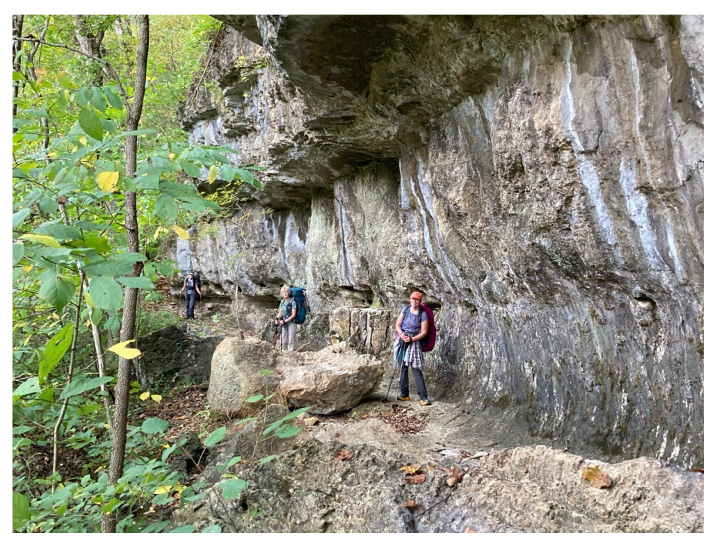
Backpackers on the Upper Current Section of the Ozark Trail.