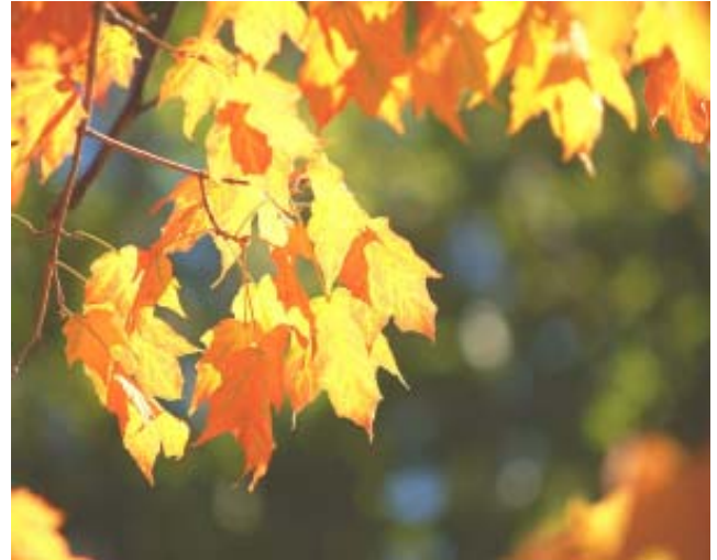
Pierre Wickramarachi (NAP Photo Contest 2007, Honorable Mention)

Photos are due September 5. For contest details and entry form, please see www.a2gov.org/nap .