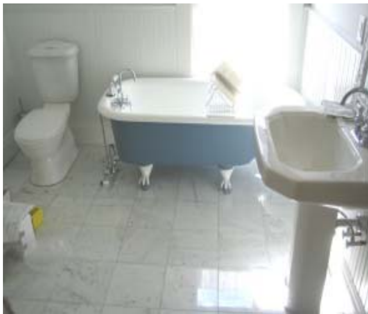
Matt & Kelly Grocoff are "greenovating" their historic home - including an eco-friendly remodel of their bathroom.

If we don't address water consumption, the future of our thirsty nation looks very grim. At least 36 states are expected to face potentially catastrophic water shortages within the next five years, according to U.S. government estimates.