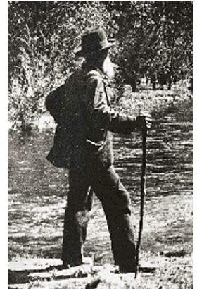
By Bob Treemore

You may not think that places so nearby will produce the feeling of relaxation that comes from “going away” to some location different than our everyday lives. The quality of these campgrounds can do just that, though. When auto fuel costs half a paycheck, they become all the more attractive.