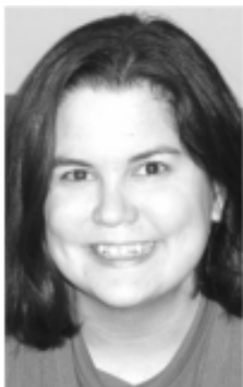
By Patti Smith

For the first time, I am seriously gardening this year. And by “serious,” I mean not just throwing some seeds into a quasi-sunny spot in our backyard. I’m renting a plot up at the park, and I have 600 square feet of dirt. That 600 square feet is now taken up by potatoes, onions, tomatoes, peppers, beans, and cucumber vines (and, uh, weeds). In addition to this bounty, I also have a share in a CSA (Community Supported Agriculture farm), and I visit the farmers’ market at least weekly.