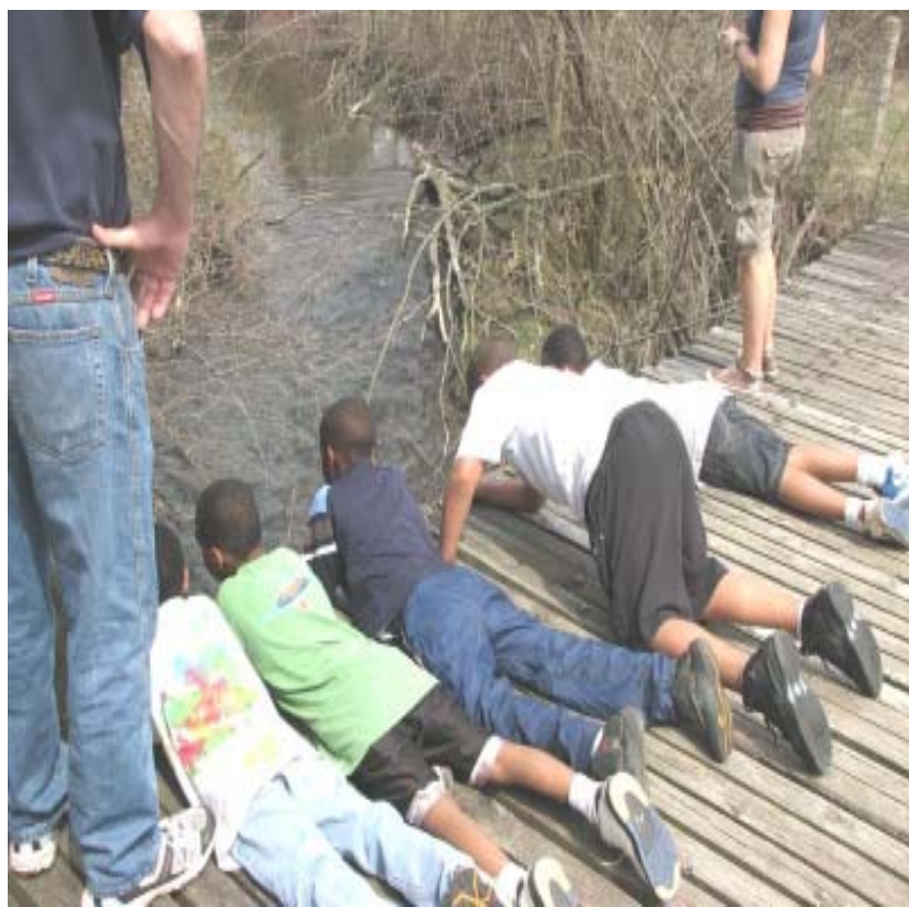
Keeping an eye out for wildlife: The Inner City Outings group look for a muskrat swimming in Fleming Creek.

muskrat and a toad were spotted, resulting in the perfect ending to an ICO trip.