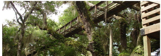
Canopy walk suspension bridge