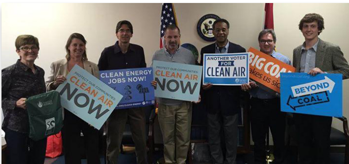
Sierra Club members meet with Congressman Cleaver in Kansas City