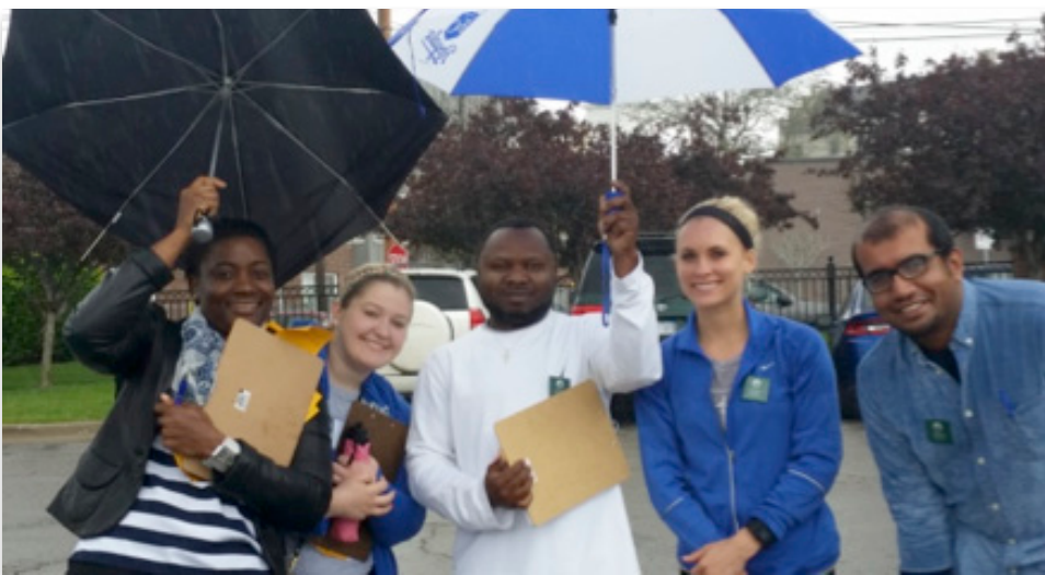
UMKC Students brave the rain to spread the word about clean air in Kansas City

This issue will be discussed in June in front of the Missouri Air Conservation Commission. To learn more or get involved, contact Gretchen at (800) 628-5333 - gretchen.waddellbarwick@sierraclub.org .