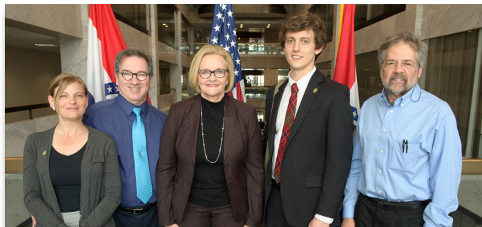
Sierra Club members meet with Senator McCaskill in Washington, DC