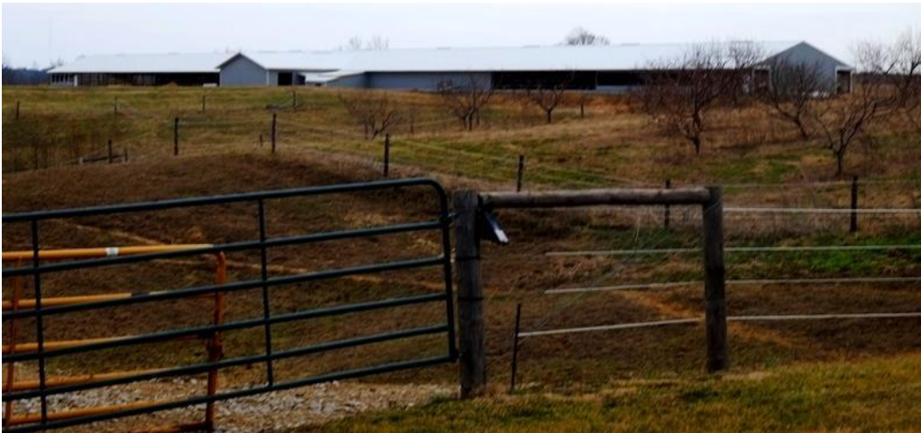
New chicken farm building uphill of northwest edge of Cedar Lake.

Many people in southern Illinois are proud of the Shawnee Forest and want to protect the integrity of natural forests as well as be humane toward animals. There is currently no protocol that allows the public to be informed or give input prior to the development of factory farms that have a multifaceted impact on our water, air, land, aesthetics, and human and animal welfare. All of this makes it ever more important for local citizens