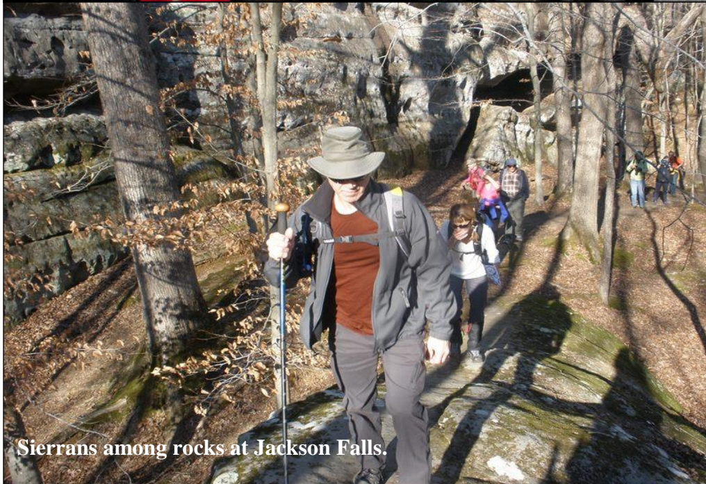
Sierrans among rocks at Jackson Falls.