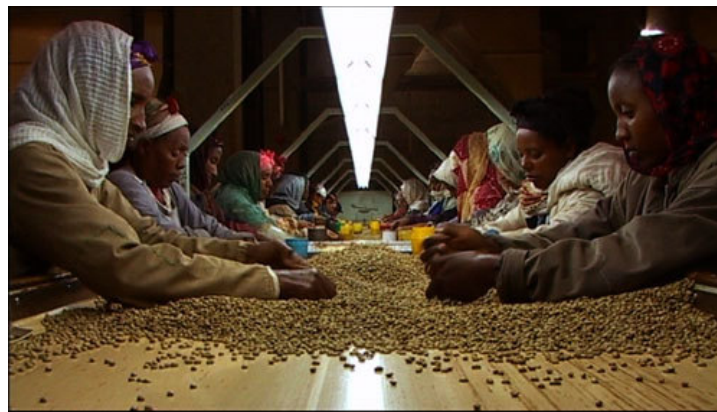
Black Gold

1. Set a Date: Set a time and date that you think would accommodate the most people in your target audience. Give yourself at least 4 weeks to get ready.