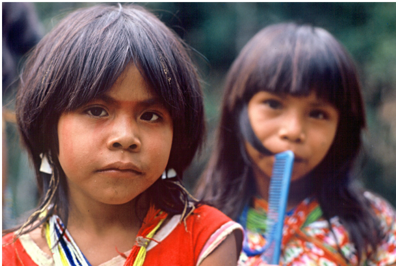
Children of the Amazon

The Sierra Club has compiled this guide to help you set up and host a Fair Trade film screening party in your community. The films listed on the Film Recommendations page all relate in some way to international trade. Through their depictions of deforestation, workers' rights abuse, climate change and corporate and government politics, these films evidence some of the ways in which trade impacts our world. After selecting a movie, do some preliminary research on its plot and the issues it brings up. The Sierra Club's website may offer some helpful background. Follow the directions explaining how to get a hold of these films. Some can be streamed or downloaded for free directly through the film's site. You can also simply email a link and your thoughts to your friends or a listserv. Other films must be purchased either through the producer's site or through a site such as amazon.com. If you are a Netflix member, see if you can rent the film online, or check out your local rental store. A few of these films may be rented free of charge through the Sierra Club. Please email responsible.trade@sierraclub.org to take advantage of this service.