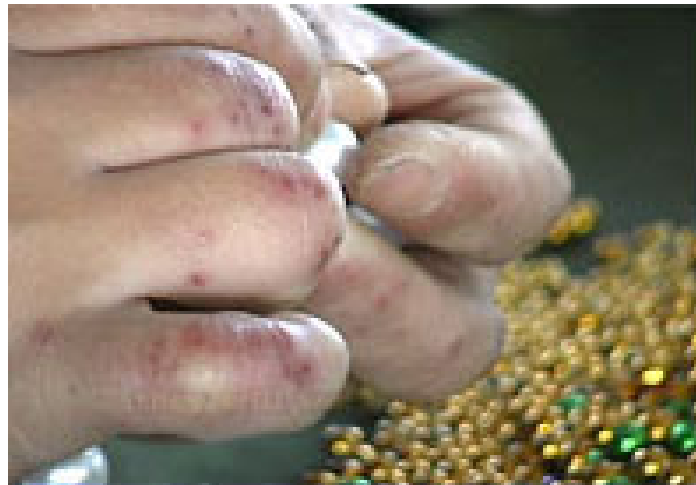
Mardi Gras Made in China