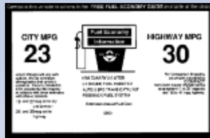
Window label prior to 2008

Although the downward adjustments in 1984 closed the gap between label value and actual fuel efficiency, they became increasingly out-of-date as due to changes in both technology and driving behavior. As a result, by the early 1990s some posited that labels did not accurately estimate the fuel efficiency that