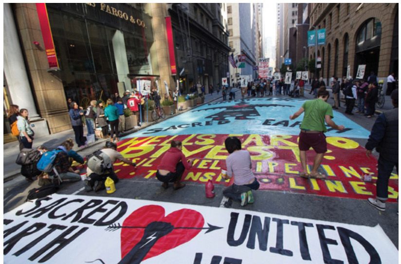
PHOTO CREDIT: Guerrilla street painting outside Wells Fargo headquarters at a November rally led by Idle No More and allies. Photo courtesy Peg Hunter via Flickr Creative Commons.

RSVP: http://tinyurl.com/divestwellsfargo