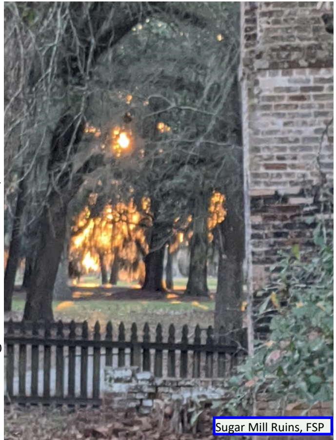
Sugar Mill Ruins, FSP