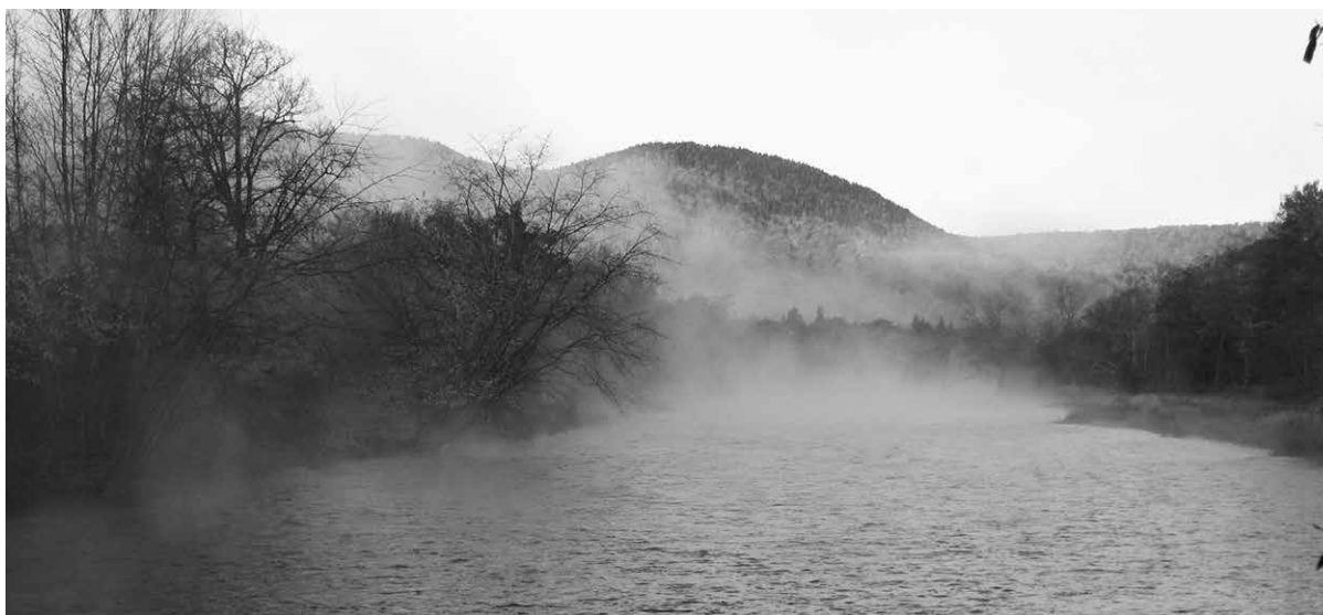
Looking down the East Branch of the Penobscot in Katahdin Woods and Waters National Monument.

"When it comes to caring for the earth, the Sierra Club and the Wabanaki have many of the same goals and values," he said. "Their culture is one of sustainability—in agriculture, fishing, everything. We can learn a great deal from them."