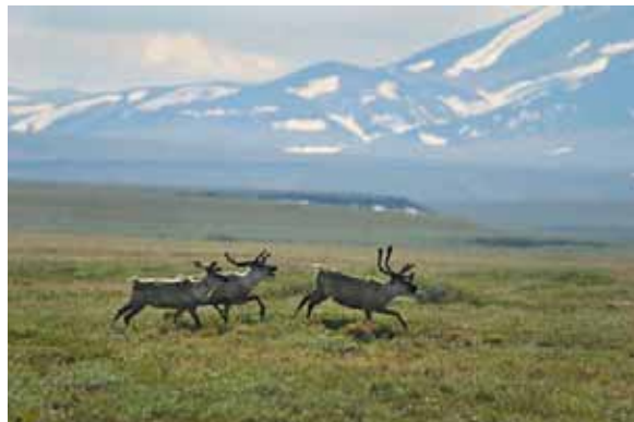
Caribou along the Kokoik

There is good news, too. With President Obama's