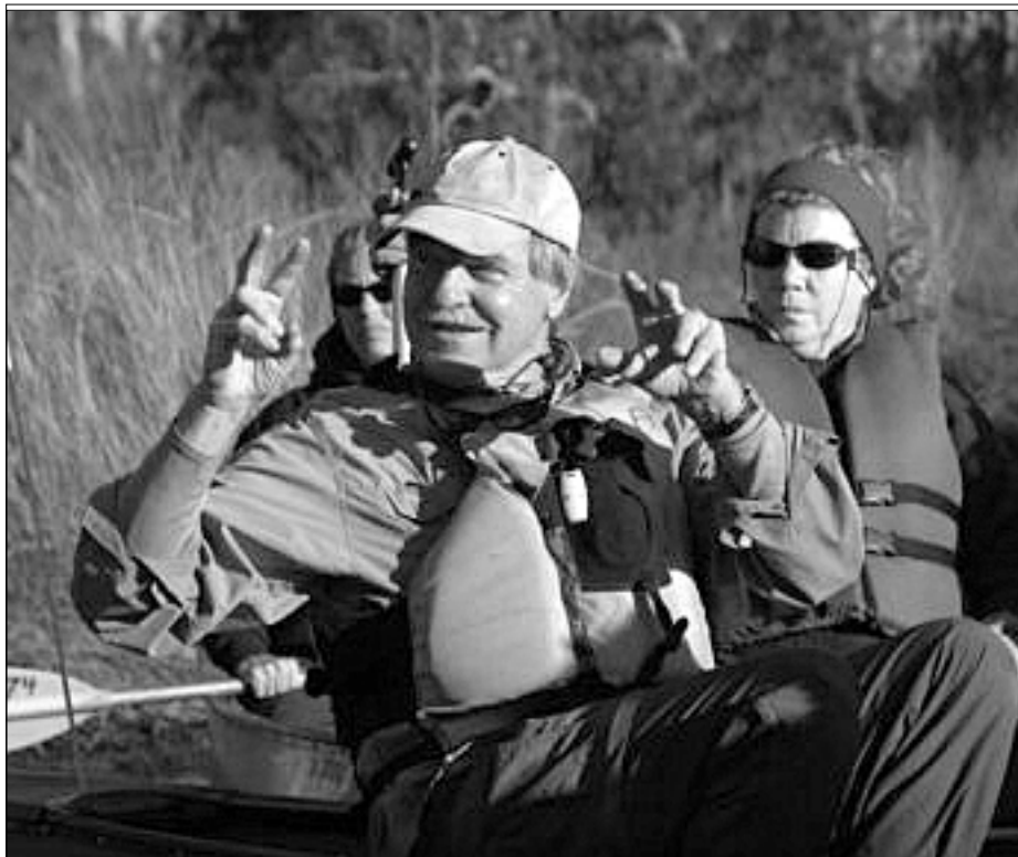
Byron in his element

close-in wetlands and swamps, these are great. There is more visible wildlife like birds—especially in the winter”.