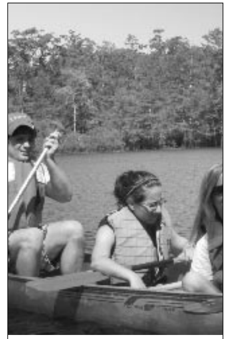
Sierra Club Outings

ANNOUNCEMENT Get your newsletter online...saves postage and time. email llesliemarch@msn.com Get the news first.