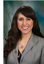
Rep. Athena Salman (D-26)

A good portion of the Democratic Caucus in both houses are Green Guardians. These legislators missed few votes and consistently voted against measures to weaken environmental protection. In the House, they led a two-hour fight against SB1493, which gives the ADEQ the authority to pursue a Clean Water Act that protects wetlands, washes and Arizona waters. They noted the lack of clarity on how it would be implemented, the lack of funding and personnel to implement it, and concerns about the public process. These Green Guardians voted consistently against dirty energy bills, as well as measures that weaken protection for cultural resources, our Clean Elections program, and more.