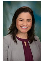
Rep. Isela Blanc (D-26)