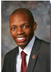
Rep. Reginald Bolding (D-27)