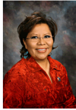
Sen. Jamescita Peshlakai (D-7)