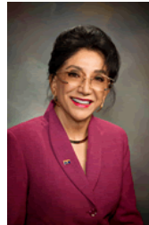
Sen. Olivia Cajero Bedford (D-3)