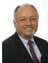
Rep. Macario Saldate (D-3)