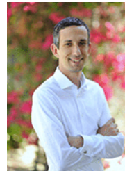
Sen. Sean Bowie (D-18)