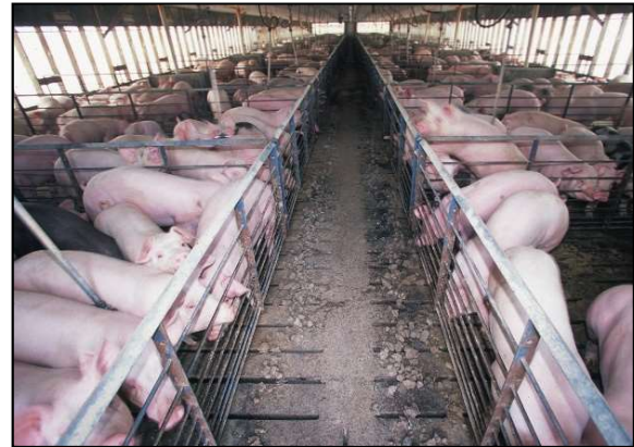
Swine in a concentrated animal feeding operation (CAFO).

As of 2018, 30 percent of the greenhouse gas emissions in Iowa were from the agriculture sector. 17 Changes in agricultural processes can reduce (or even increase) greenhouse gas emissions. Agriculture is in a unique position with respect to greenhouse gas emissions. A number of agricultural practices can solve some of the problems of excess carbon dioxide and other greenhouse gases through sequestering carbon in the soil. Changing on-farm practices, including livestock production practices, to those that are more sustainable can also reduce the amount of greenhouse gases that are emitted.