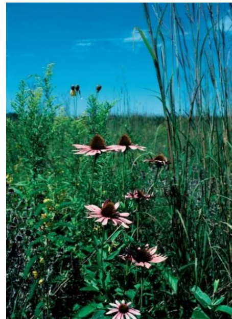
Prairie plants.