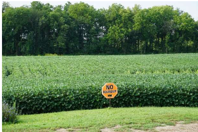
Soybeans grown without Roundup, field is near Pilot Mound, Iowa