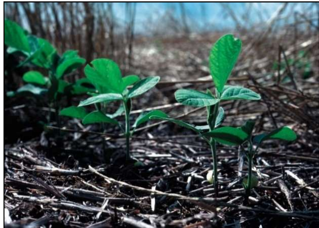
Soybeans planted using no-till agriculture methods.

In contrast, modern industrial agriculture is based on maximizing production as efficiently as possible, using economies of scale, while externalizing as many costs as possible. This results in short-term economic gains and economic success. Yet, it causes many unintended consequences such as loss of soil fertility; loss of carbon sinks such as wetlands and carbon retained in the soil, prairies and forests; and the inability of the land to accept all of the wastes produced by the farm and to recycle those wastes satisfactorily without polluting the environment. The existing industrial-scale agriculture techniques leach or leak nitrogen from the soil into the water and air, resulting in excessive soil erosion. This nitrogen, along with phosphorus, causes the Dead Zone in the Gulf of Mexico, an area where no living animals can survive in the water because fertilizer-fed algae deprives the water of oxygen. Furthermore, some of the techniques used in industrial agriculture, including storing liquid manure in pits and using synthetic fertilizer, emit large quantities of greenhouse gases into the atmosphere, exacerbating climate change.