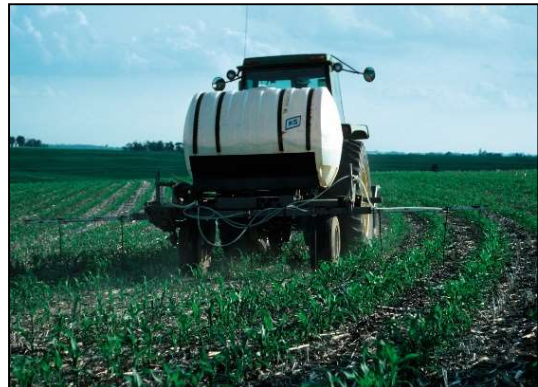
Application of nitrogen fertilizer on a no-till field.

Similar to the USLE, "T" (tolerance) values could be established for both nitrogen and phosphorus in the UWQE model. Those T values would be based on the goals of the INRS for agriculture—a 41% reduction in nitrogen loading and a 29% reduction in phosphorus loading—normalized to a farm field level.