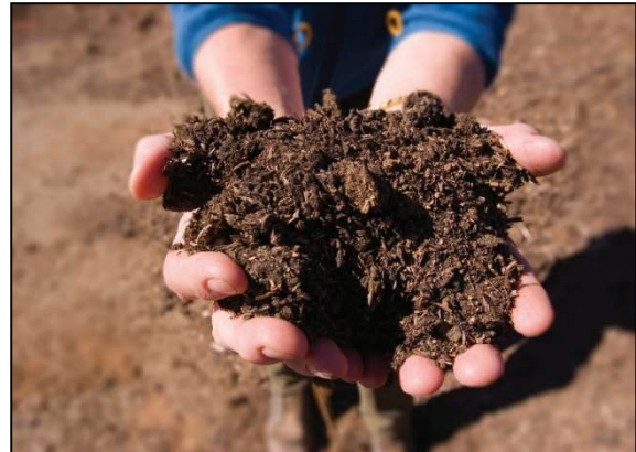
Compost made of manure and other organic solids.

Although statutorily mandated at $20 million annually, the Iowa legislature determines the actual appropriation each year. The governor must then either agree or veto the appropriation. Unfortunately for a number of years, REAP has been funded at several million dollars less than $20 million. REAP funding is generated from the sale of natural resource license plates and from the Environment First Fund (which is funded with gambling receipts).