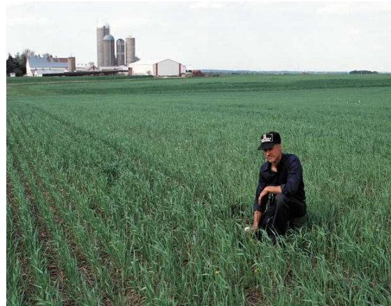
Cover crops on a field in Black Hawk County, Iowa.

Focusing on soil can, however, draw our attention to something we can all see and touch. Soil can “ground” us as we seek to transform our agriculture system to one in which ecology and nature are at the forefront, and the people who produce our farm products, now and in the future, are valued and respected.