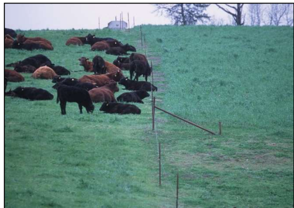
An example of managed grazing, where cattle are feeding in the left paddock while the paddock on the right of the fence is resting.