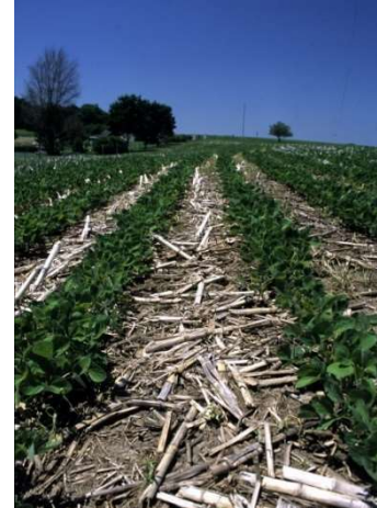
A field showing no-till agriculture. Soybeans were planted without plowing the cornstalks into the ground.

The Iowa Chapter believes that animals are a key part of sustainable agriculture. Because industrial-scale animal production contributes a large quantity of greenhouse gas emissions, which lead to climate change, some people choose to reduce the amount of meat that they consume as a means to reduce their personal carbon footprint. Options may include Meatless Mondays where only a plant-based diet is consumed on Mondays; eating a vegetarian diet that includes dairy products and eggs but not meat; and vegan diets where no animal products or meats are eaten. Farm animals are an essential component in the regenerative, whole-farm systems that show the greatest promise for mitigating climate change while meeting the food needs of both current and future generations. However, a regenerative agriculture would likely require far fewer farm animals than are in confinement operations today.