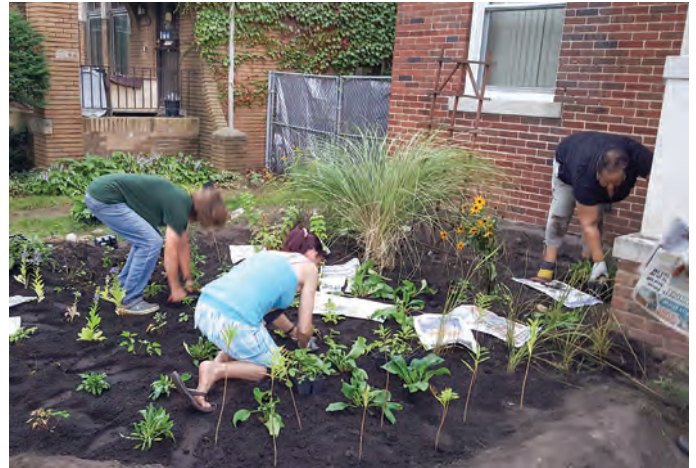
Sierra Club and partner Friends of the Rouge have installed more than 80 rain gardens in Detroit.