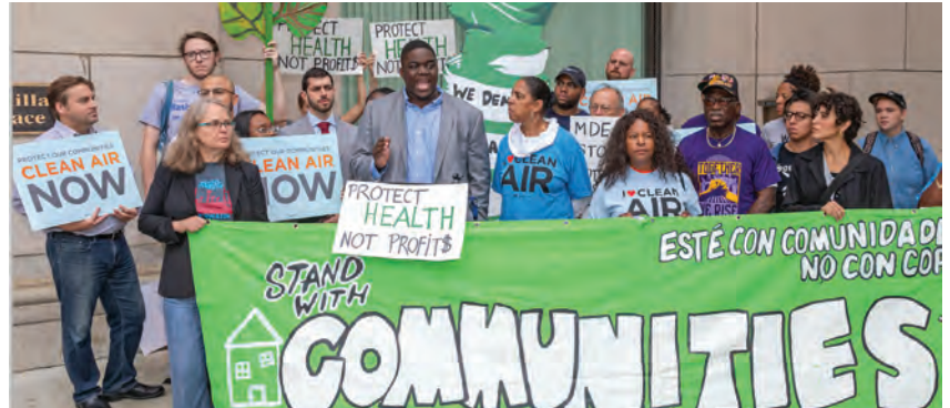
Activists rally to hold Marathon Oil accountable for its effects on air quality.

Efforts surrounding the AK Steel facility have also been successful. Recently, attempts to block the company from tripling levels of lead and manganese emissions were productive after sustained community pressure from surrounding residents, Sierra Club, lawmakers and other advocates.